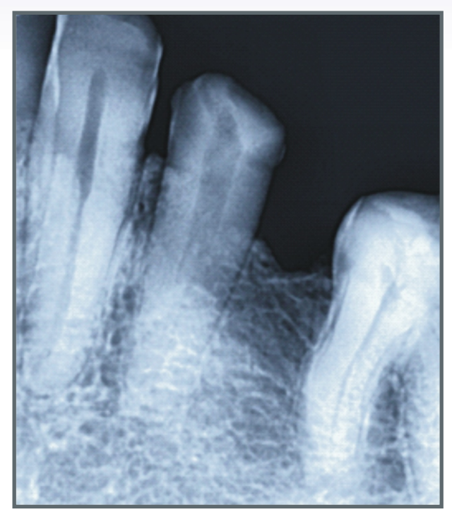
Figure 1:Pre-operative IOPA