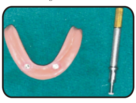
Fig.6 Processing cap was removed