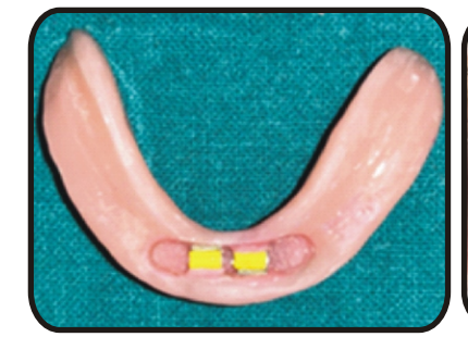
Fig.13 Picked-up clips in denture