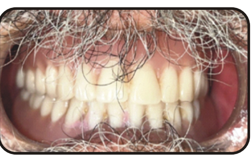
Fig.14 Final Insertion of the prosthesis