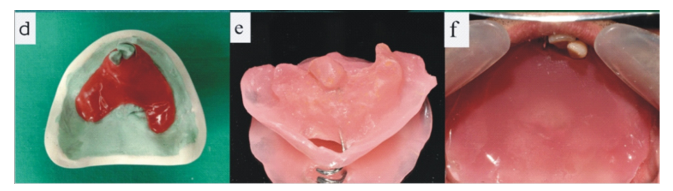
Figure. 2. 2a. Alginate impression 2b. Master cast 2c. C-Clasp 2d. Wax adaptation 2e. Final prosthesis 2f. Postoperative rehabilitation