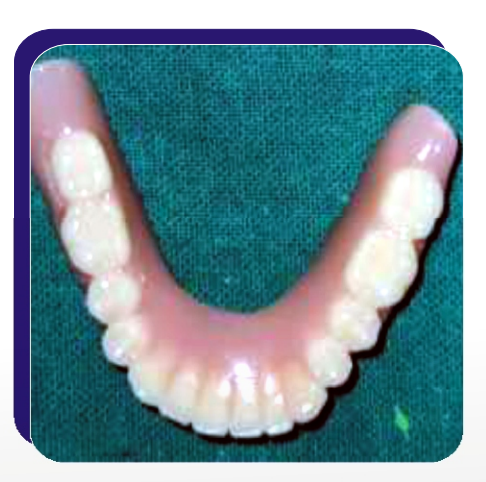
Cured complete dentures