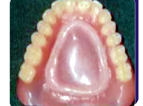
Reservoir lid adapted over cured denture

Reservoir index made and reservoir lid made using soft bioplast sheet