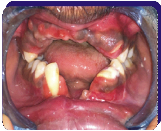
Pre-operative Radiograph And Intra Oral Photograph

OPG Reveals- Two surgical miniplates evident which extends from right Para symphysis and symphysis to left Para symphysis and symphysis region. Missing tooth -11-14,21,22,32-42 Root Stumps -14,22,23.