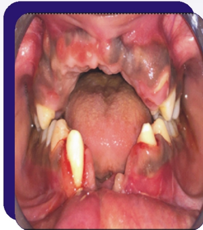
Tooth Preparation Done -33,34,43