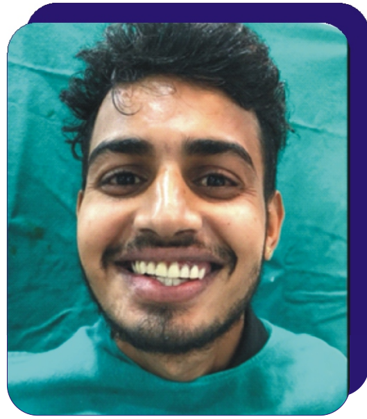
Pre Op & Post Op Photograph of Patient