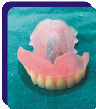
Flexible Removable Partial Denture Fabricated