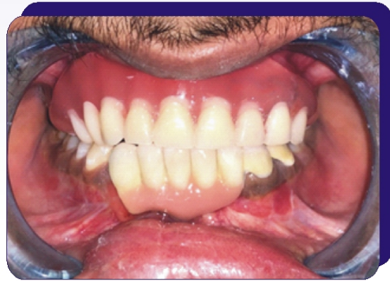
Post Operative Intraoral Photograph