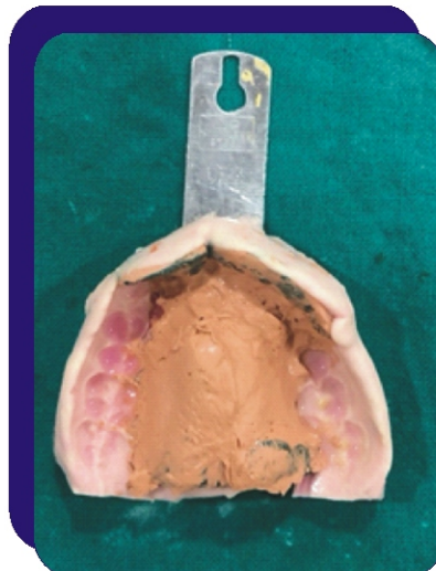
Fabrication of Maxillary Custom Tray & Border Moulding