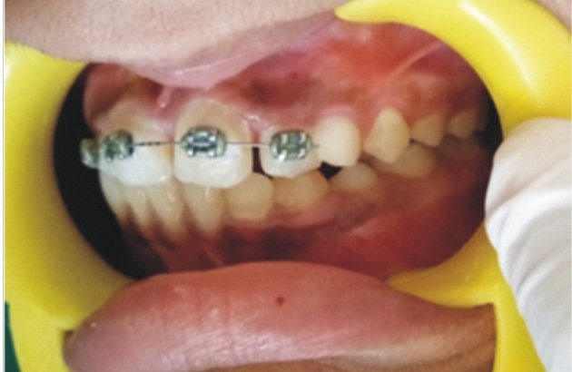
Fig 6,7- Show sectional bracketing to upper anterior to achieve finished alignement