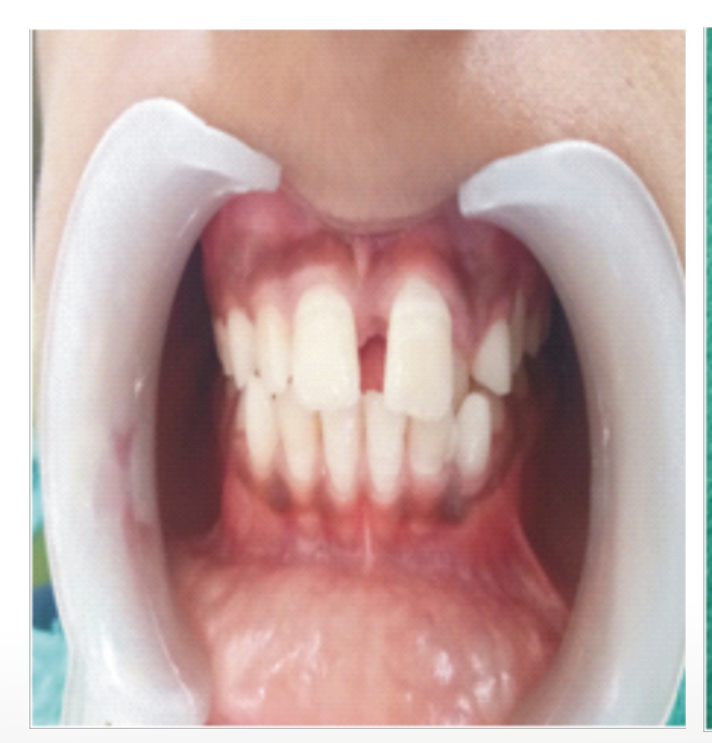
Fig 1- Preop picture depicting midline diastema with single tooth cross bite

Firstly he was recalled every week for the activation of split labial bow. He was made to wear it full time and for this the split labial bow arm was curved like a hook around 21 and also fixed with composite restorative material to secure it at place. In the 4th week, midline diastema was found to be corrected (Figure 4.5). Then after 4 weeks appliance was taken out cleaned and activation of dounle cantilever spring by opening 1mm was done and then appliance again placed in the mouth. Bite upto an optimum level was opened by placing composite stops on molars. After 2 weeks, crossbite was seen to be corrected. Hawley's appliance with z spring sustained for another 2weeks. After which sectional bracketing was done by bonding upper anterior with bond-bracket slot0.18" standard edgewise and inserting round NiTi wire of days 0.14" for 6 weeks for final finished occlusion(Figure 6,7,). As cross bite correction is self retaining hence retainers were not recommended. Patient was on followup for 1 yr and no relapsed was noticed.