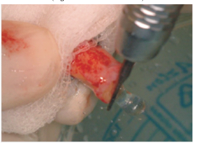
(Figure 4- Root end resection)