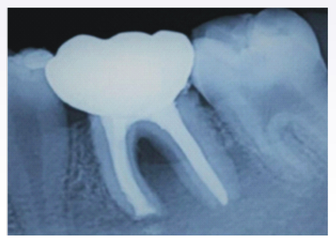
(Figure 9- One year follow up)