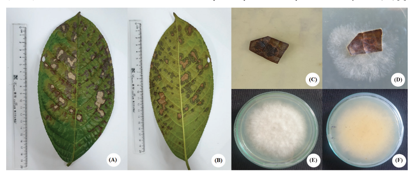
Fig. 1. Symptoms on diseased leaves and fungal isolation from C. tamdaoensis Ninh et Hakoda. (A, B) Upper and lower of disease leaf; (C) Leaf section put on PDA medium; (D) Mycelia growth; (E, F) Upper and lower of fungal isolate implied anthracnose after 7 days culture.

Typical anthracnose symptoms in C. tamdaoensis Ninh et Hakoda were clearly expressed on leaves whose necrosis spots were dark brown or black. The results showed that the symptoms occurred on two sides of the diseased leaves (Figs. 1A, B). Firstly, the disease spots usually appear small and brown. Then, these brown spots spread and the color changes. These symptoms on the disease leaf of C. tamdaoensis hakodae in this study were the same as the previously described study on Camellia chrysantha (Hu) [2].