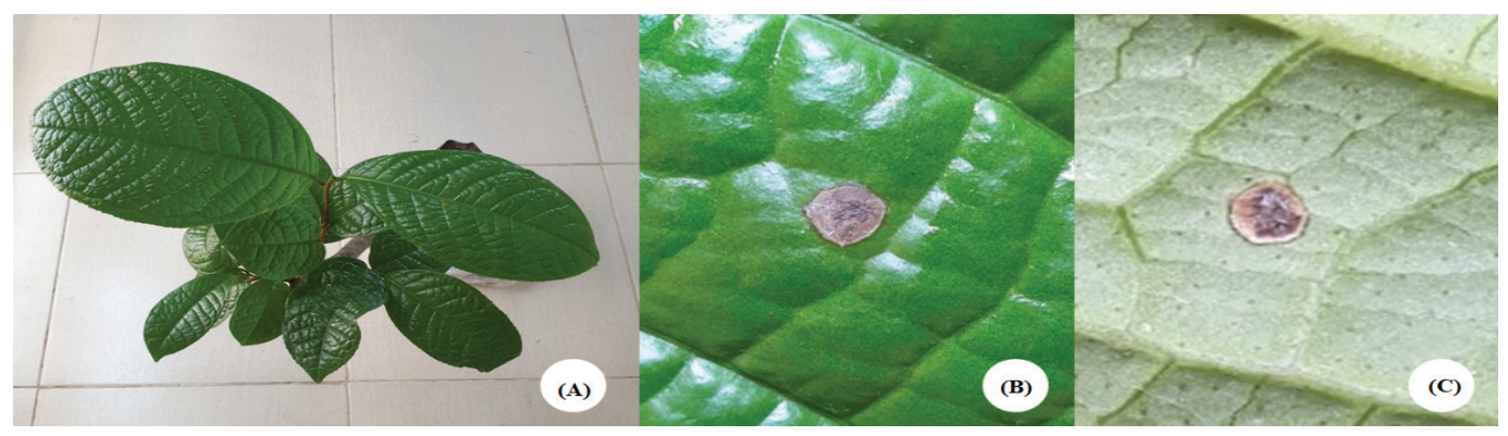
Fig. 3. Pathogenicity test back on the healthy leaf of C. tamdaoensis Ninh et Hakoda. (A) Whole plant, (B, C) Lesions caused by Colletotrichum siamense TD1, on upper and lower sides, respectively.

This result demonstrated that the isolate from C . tamdaoensis Ninh et Hakoda disease caused anthracnose.