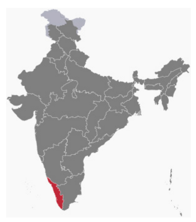
Figure 1. Location of the present study

For the present study, Ayurvedic preparations commonly prescribed for the growth and well-being of children were selected based on an active search of previous literature (1,2). As the composition of these formulations presents minor variations indigenously, recommendations and suggestions put forward by experienced practitioners in the field of Ayurveda were also taken into account before selecting the products. A total of nine different ayurvedic products in solid, semi-solid, and liquid forms were chosen based on convenience sampling, and three samples of each of the same products were tested for fluoride content. Among these three samples of each product, one was prepared locally under the direct supervision of a registered Ayurvedic practitioner. The other two samples of the same product were purchased from two different branded manufacturers.