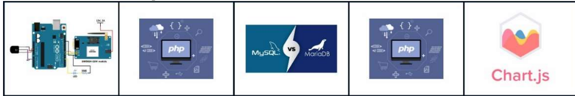
Figure 2. Information system concept

module. The data is then stored within another component and can be used as a control trigger through the GSM module for sensors that will reduce the water flow through the electric valve or reduce the flow time or reduce the number of active nozzles of the automated laundry. Finally, data on resource consumption can be displayed to users with different privilege levels within the third component of the realized software solution, that is, the Corinthian interface.