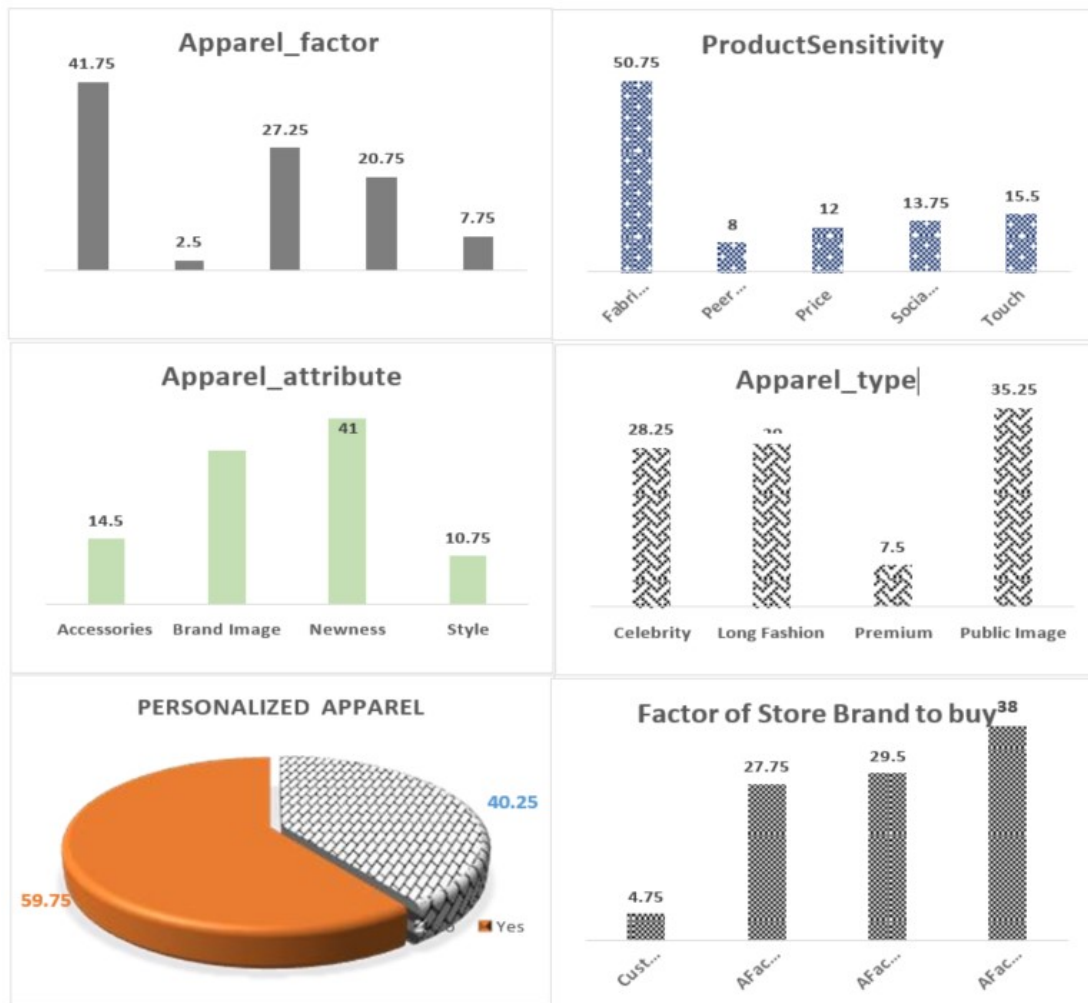
Figure 1. Product and Store based Attributes

With reference to Product and Store based Attributes,