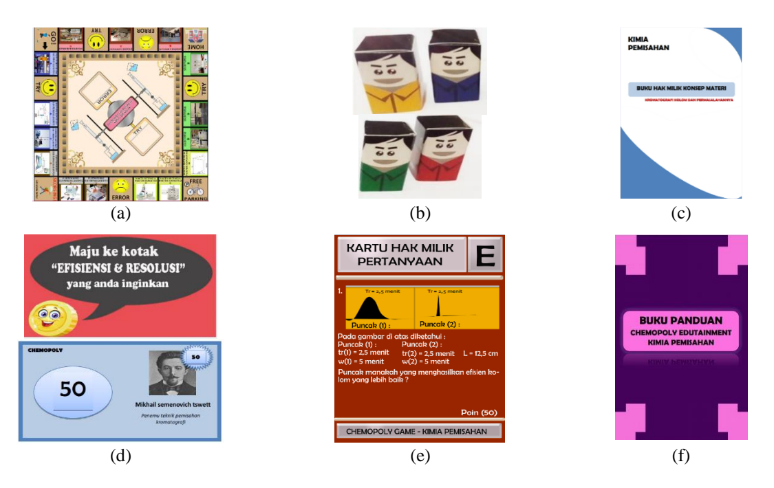
Figure 1. Some Equipments of Chemopoly-edutainment: (a) Board Game, (b) Pawns, (c) Material Book, (d) Try and Point Cards, (e), Problem Card, and (f) Guide Book

Chemopoly-edutainment that used in this study was the media that we have developed previously. Based on the developed result, the feasibility the chemopoly-edutainment was found to be 95.75 or very decent categorized. Based on the result, it was concluded that this media was feasible to be used in the learning process on chemical separation subject. Some parts of chemopoly-edutainment equipments are shown in Figure 1.