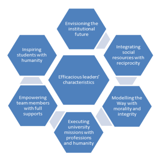
Figure 3. Supportive traits of efficacious leaders in university