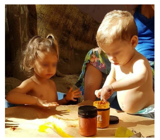
Figure 2. "Keep within the reach of children!"