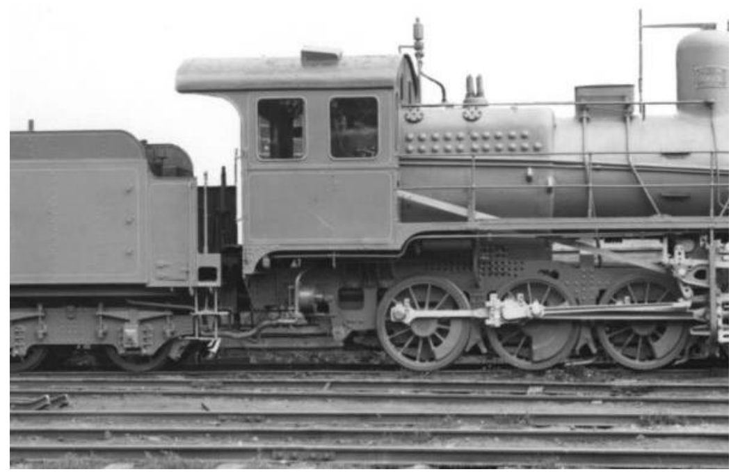
Figure 3. Shch class freight locomotive designed by Kharkiv Locomotive Plant (today, the Malyshev Factory). In total, about 2000 Sch class locomotives were manufactured by different plants in the 1900s – 1920s (Malyshev Plant, n. d.).

After the work of various commissions, the technical bureau of the Kharkov Steam Locomotive Plant under the guidance of engineer O. S. Rayevsky in 1906 designed a freight steam locomotive with a two-cylinder machine compound type 1- 4- 0 (Bogatchuk, Mazylo, Pikovska, Makarov, Bielkin, Mangora, & Mangora, 2022). In the technical documentation, the new locomotive was known as the "Chinese-Eastern Railway modified type 1-4-0" or "normal type 1905" (Figure 4). In the same 1906 Kharkiv plant built the first steam locomotive of the "normal type of 1905", which received the designation Yuh3501 and was sent to the Ekaterinisk Railway. In 1912, such locomotives were designated as the Shch class after the name of Professor N. L. Shchukin.