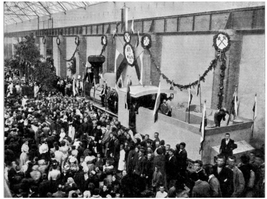
Figure 1. Blessing the first "normal type" O class steam locomotive at the Kharkiv Locomotive Plant (Malyshev Plant, n. d.).

From 1897 to 1903, the Kharkiv Locomotive Plant produced 733 O^D class steam locomotives (Figure 1).. These were four-axle locomotives of the so-called basic type (hence the letter "O" by the Russian word "основной") with a steam engine capacity (depending on the modification) of 550-720 hp (Kharuk, 2019, pp. 8–9) and a Joy valve gear. Their axle formula was defined as 0-4-0, where the middle digit indicates the number of leading axles (with large-diameter wheels; the more powerful the locomotive, the more leading axles it has). The first digit indicates the number of guide axles (in front of the leading axles; their purpose is to reduce the probability of the locomotive derailing when passing curves), and the third digit indicates the supporting axles (located behind the leading axles and designed to reduce the loads on them).