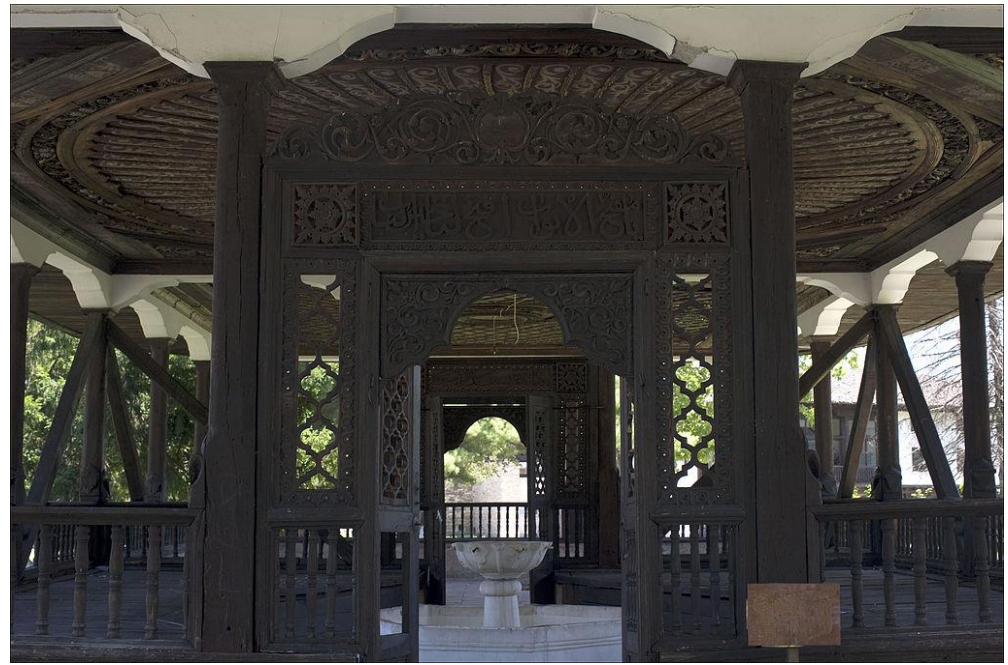
Image 2. Dervish Arabat Baba Teke, Tetovo, Macedonia. <a href="https://commons.wikimedia.org/wiki/File:Arabati">https://commons.wikimedia.org/wiki/File:Arabati</a> Baba Teke, Tetovo.jpg