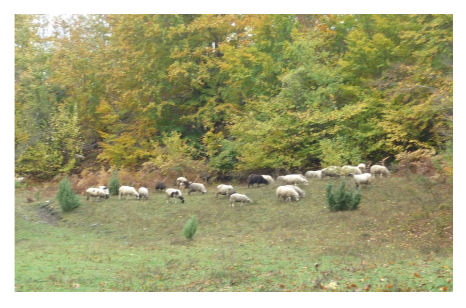
Fig. 9. A flock of sheep Note: A rare picture, unfortunately in the Vranještičkom geo-space