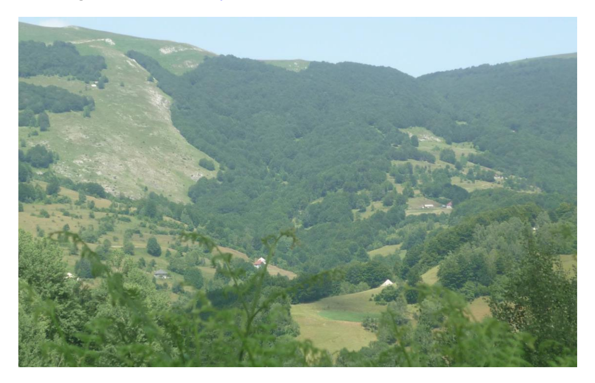
Fig. 6. View of the northeastern part of Vranještica Note: A combination of mystical energy and magnificent nature

The analysis of the above points to the conclusion that the motives for leaving this rural settlement were multiple. We will reduce them to the most important ones, in our opinion: