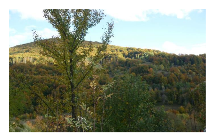
Fig. 11. Forests Vranještica Note: Green oases of peace and quiet

As it could be noticed earlier, the forests on the territory of Vranještica have always been either an integral part of the property and the backyard, or the immediate hinterland, i.e. the source of materials, shelter, refuge, climate regulator, micro locations ... As a large present element of life, forests will be a significant spatial component in future trends in the development of the economy and construction policy. In the future treatment of forests, a larger volume of felling or some other action that would be contrary to eco-agriculture and ecotourism should not be allowed. The volume of felling should be adjusted to the condition of growing groups within the appropriate class of forests, in order to ensure wood mass on one side, and preservation of forest quality on the other. Due to the efficiency of planting, it is necessary to afforest purely forest terrains, especially those created after felling. Therefore, erosive areas and other unstable soils should be afforested as a preventive measure to protect the soil. The volume of felling should not be increased, and the actions should be directed to sanitary felling, in the maximum volume. In general, forestry should be integrated with eco-agricultural development. Analyzes would probably show that forests could provide multiple incomes in the eco-agricultural concept compared to conventional management (Bulatović et al., 2019).