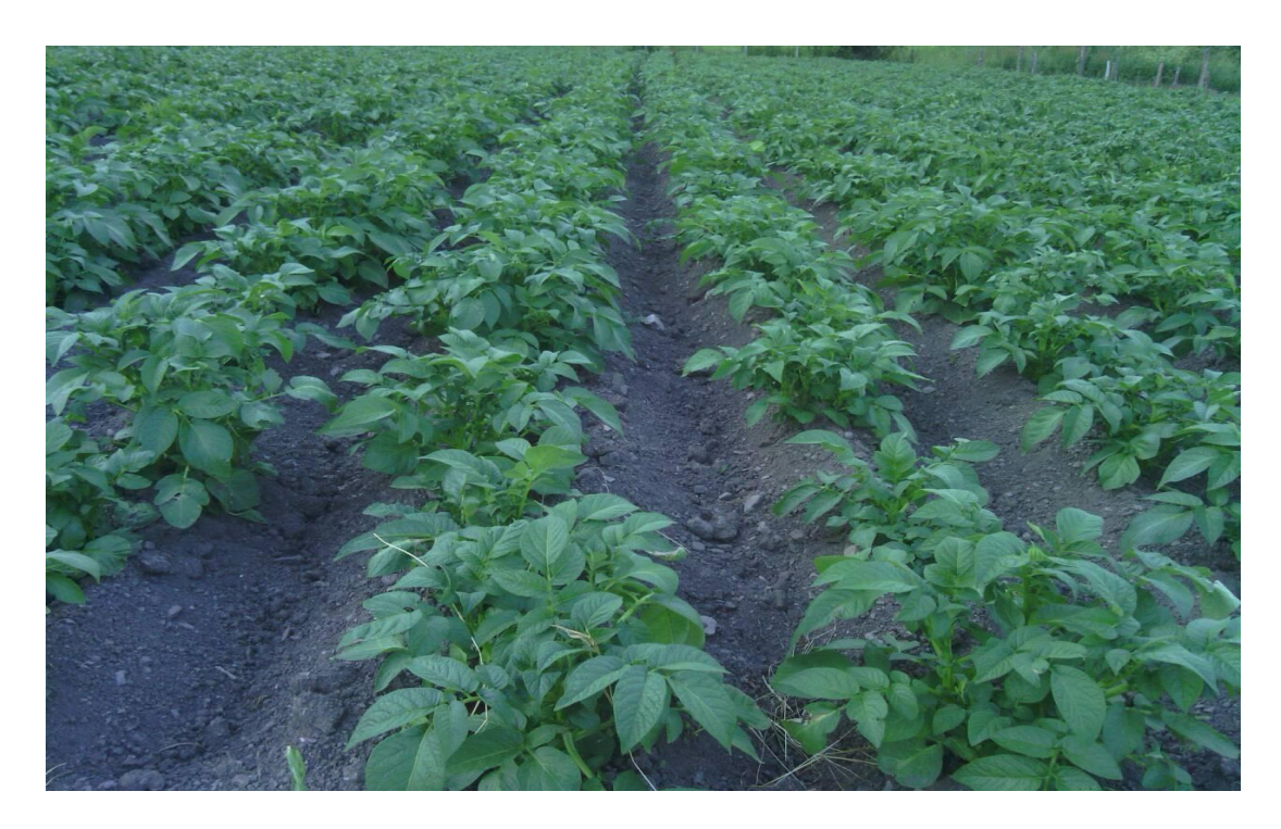
Fig. 4. Agricultural plot Note: Potato growing (Vranjestički potatoes – the most famous potato in Montenegro).

The forest vegetation of the rural settlement of Vranještica is difficult to single out. This is primarily a consequence of climate and general ecological changes in the past (tertiary) and the natural effort of plant communities to adapt to changes and preserve them. It is the lowest belt of alluvial plains of Vranještička River and Suvogorska River, represented by hydrophilic forests of willows and poplars (Sallcon Albae), alder (Alnion Glutinesae) ... Then follows the forest belt of oak (Auercetum frainetto ceris), beech and beech – fir forests (Fagion moss). Some mountainsides of this rural settlement are made up of pine forest stands. The basic orientation is to increase the area, ensure permanent and more economical production of wood mass, rational use and increase growth.