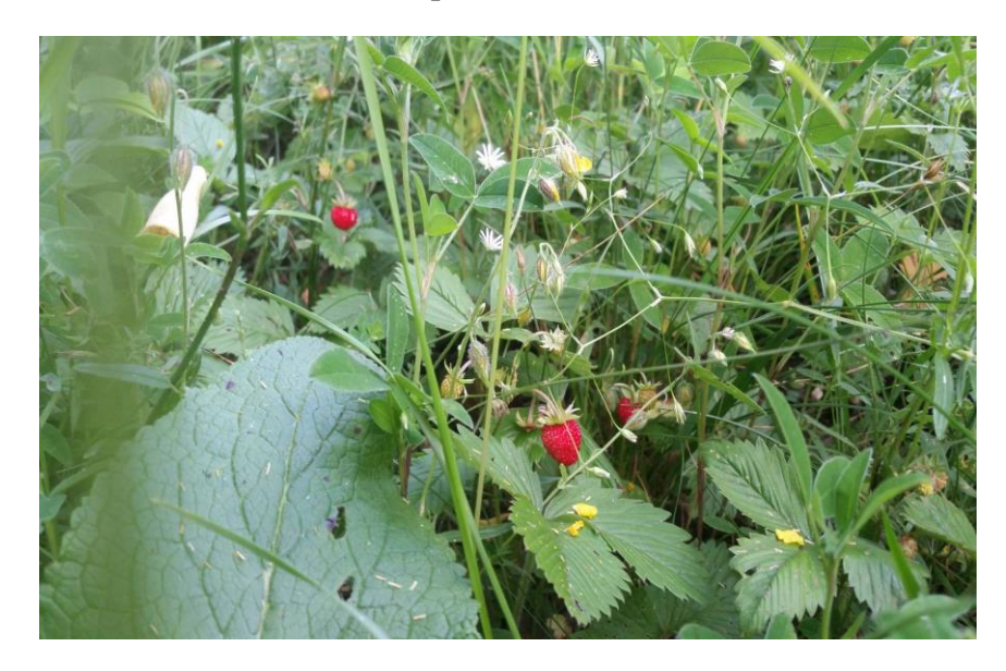
Fig. 10. Wild strawberries

There are very favorable conditions for farming in the settlement, which means the expansion of areas under vegetables. On very modestly represented arable lands, with the application of larger amounts of manure, the introduction of appropriate crop rotations and better tillage, higher production of potatoes and fodder cereals can be achieved. In the rural settlement of Vranještica, in addition, appropriate measures are to be taken to stop the declining trend of arable land, by increasing the level of equipment of households with modern machinery, especially for the production, transport and conservation of roughage. The implementation of the consolidation program, in order to eliminate the current state of high fragmentation and fragmentation of arable land, is also one of the conditions for the recovery of farming. Fruit growing would be done on all suitable plots, with the basic condition of providing efficient traffic connections, fast transport of very sensitive products. Due to the differentiation of natural conditions, intensifying sheep and cattle production can achieve optimization in the exploitation of production potential. It is necessary to do a study and investigate the suitability of areas for the production of medicinal herbs. However, an abundance of various medicinal plants has been noticed, which could be imposed by organized production and cultivation as a profitable branch of farming the cultivation of industrial plants.