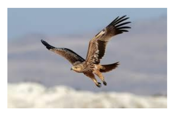
Fig. 12. Eagle crusaders Note: Lords of the sky over rural settlement Vranještica

In the rural settlement of Vranjestica, hunting should be viewed as an activity on the line of demarcation between eco-agriculture and forestry and ecotourism. Special attention should be paid to the constant care that the game in the mountainous hinterland of the village is well fed and fed in winter, so that it can develop properly and reproduce naturally. The basic investment recommendations in hunting refer to investment investments in landscaping and improvement (feeding grounds for hairy and feathered game ...), as well as investment investments in comfortable waiting rooms (for hunting in winter conditions and wolf hunting).