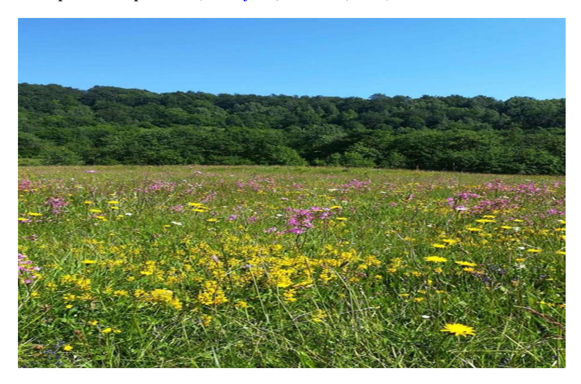
Fig. 8. Meadows surrounded by forest complexes Note: A real gift of nature

Within this framework, the accompanying production of cow's milk can be successfully developed, i.e. sheep breeding is mainly oriented to the market production of lamb. The chance of the rural settlement of Vranještica is in the untapped possibilities of extensive cattle breeding. First, here we mean the project of forming sheep and cow farms. In addition to construction works, the procurement of appropriate equipment, agricultural machinery intended for the production and preparation of animal feed, as well as the procurement of a part of the basic stock (breeding cows and bulls, sheep and rams), whose reproduction would gradually replace the existing castles. Such households could then produce cheeses and other dairy products according to the obtained standardized technology, with specific packaging. Over time, a sign or even a health food label could protect the products (see Rajović, Bulatović, 2012).