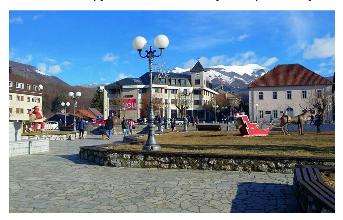
Fig. 13. Municipality of Kolasin Note: A chance in the development of rural settlement

Suitable physical-geographical factors, and above all the abundance of water, provide opportunities for the rural settlement of Vranjestica to develop into one of the most attractive tourist villages in the municipality of Kolasin, i.e. Montenegro. Several preconditions for this concept are necessary: the exceptional natural beauty of this rural settlement and orientation to eco-agriculture, i.e. ecotourism, would increase the quality and specificity of the tourist offer (here would require some education of hosts and organizers of eco-agriculture in terms of emphasizing certain elements of the offer). Relying on the administrative center Kolašin, in organizational, marketing and financial terms, with the help of obtaining clientele (which is demanding in terms of landscape exclusivity, requires proximity to peaks, special natural sites, peace and not many tourists, and not demanding in search of high comfort). An even more special type of tourist offer, which is completely imbued with agricultural development, is ecotourism agricultural farms. Tourism is a secondary part of the business here, complementary to the basic production.