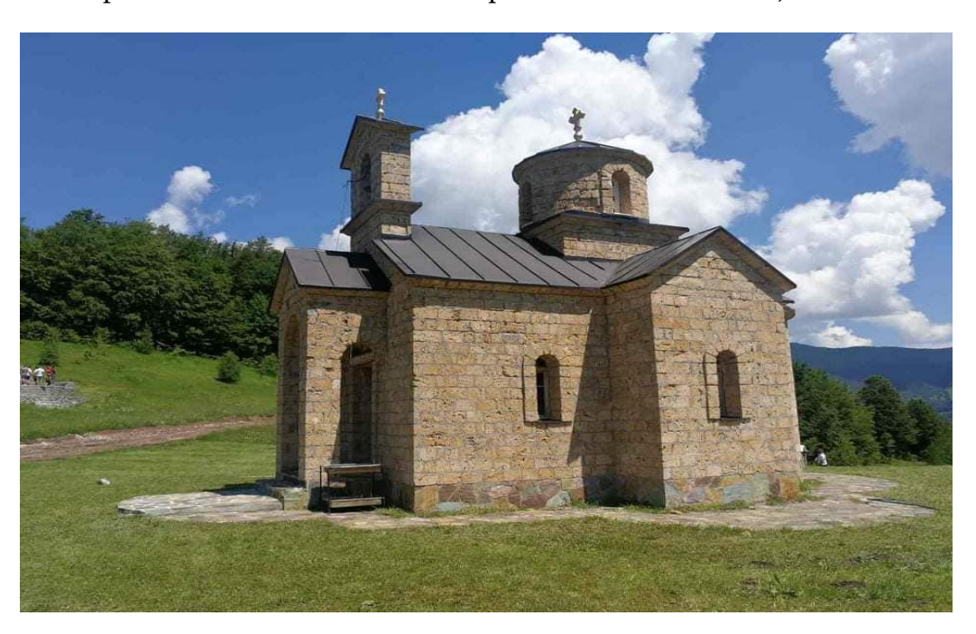
Fig. 5. Bukova Poljana (Church Lazarica) Note: Where nature and history, culture and art, value and tradition meet

The forest vegetation of the rural settlement of Vranještica is difficult to single out. This is primarily a consequence of climate and general ecological changes in the past (tertiary) and the natural effort of plant communities to adapt to changes and preserve them. It is the lowest belt of alluvial plains of Vranještička River and Suvogorska River, represented by hydrophilic forests of willows and poplars (Sallcon Albae), alder (Alnion Glutinesae) ... Then follows the forest belt of oak (Auercetum frainetto ceris), beech and beech – fir forests (Fagion moss). Some mountainsides of this rural settlement are made up of pine forest stands. The basic orientation is to increase the area, ensure permanent and more economical production of wood mass, rational use and increase growth.