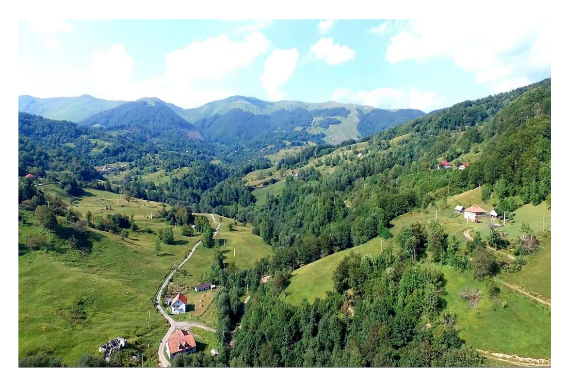
Fig. 2. Rural settlement Vranještica Note: if you have ever wondered what it looks like when winding green hills, mountain streams, unreal landscapes and very rare plant species come together - now is your chance to see it *