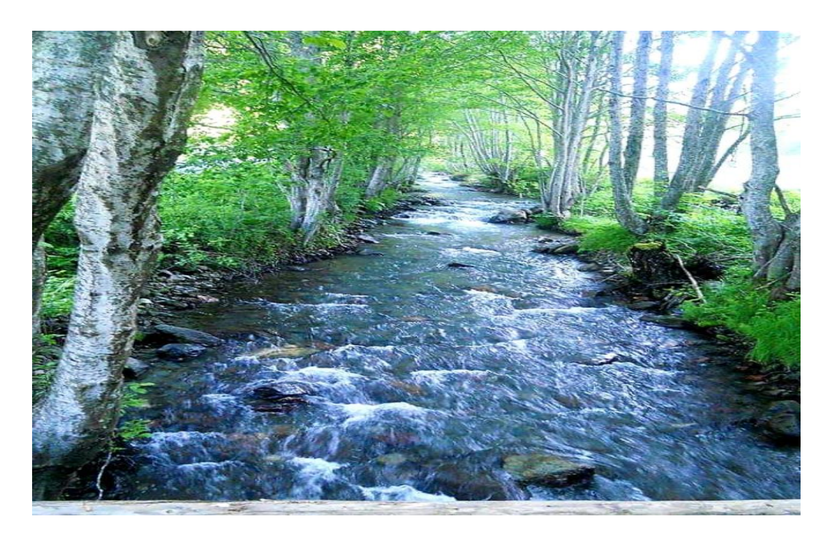
Fig. 3. Vranještička River Note: Enchanting beauty where peace, silence and the laws of nature reign