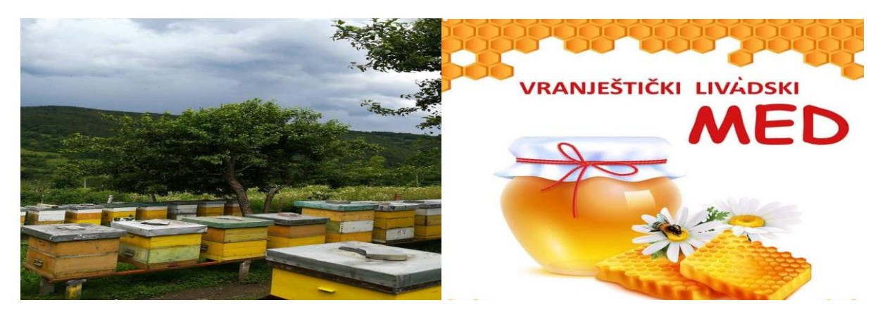
Fig. 7. Beekeeping in Vranještičkom geo-space (Vranještički meadow honey) Note: There is no greater joy than when you collect honey and give it to your loved ones to sweeten and enjoy

Rural settlement Vranjestica has favorable conditions for livestock development. Within animal husbandry, especially those branches should be developed for which there are special quality conditions. Natural conditions favor sheep breeding as the main – cattle breeding, and then cattle breeding with a significant increase in the head to the optimum, which is determined in cooperation with other branches. Reclamation of pastures would improve the conditions for cattle breeding. In that sense, it is necessary to develop projects for the establishment of meadows and amelioration of pastures. Establishment of meadows refers to appropriate agro-technical works with the basic goal of forage yield. Pasture reclamation refers to agro-technical works related to clearing the terrain, fertilizing and sprinkling grass seeds. By intensifying hay production, by applying agro-technical measures (irrigation, fertilization of meadows and pastures ...), the number of sheep and cattle can be significantly increased.