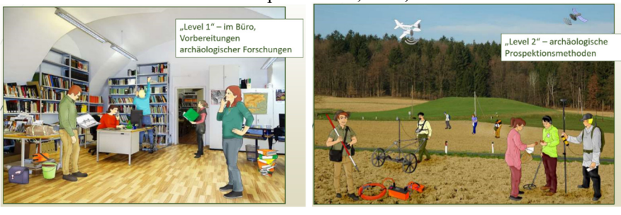
Fig. 3. Scenes from the e-learning tool in the application

The following wording dates back to 2000 from Crispin Raymond and Greg Richards: "Tourism which offers visitors the opportunity to develop their creative potential through active participation in courses and learning experiences, which are characteristic of the holiday destination where they are taken" (Impact of European Cultural Routes on SMEs' innovation and competitiveness, 2019).