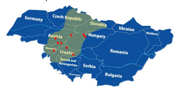
Fig. 1. Location of the Early Iron Age key-sites within the Eastern Halstatt area

Parallel to this, archaeological scope shifted from sites to the landscapes, which are defined as areas engraved with actions and interactions of natural and human factors. In many cases anthropogenic footprints as landmarks are clearly visible: e.g. castles, monumental church architectures, specific forms of cultivation (terracing). Occasionally these mutual interactions remain partly hidden, that is the case with imposingly attractive prehistoric landscapes of the Danube river basin. Focusing on the monumentalized archaeological landscapes, characterised by fortified hilltop settlements and tumulus cemeteries from the Hallstatt period (roughly the 9th-mid5th centuries BC) the Iron-Age-Danube project aims to transform the spectacular scientific value of our common heritage into a touristic potential.