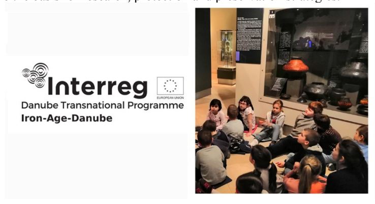
Fig. 2. Workshop for kids in the Hungarian National Museum

The collected archive data referring to the focus countries were digitalized and uploaded into an online database in order to create a unified methodology to compare information on the regional level (Iron-Age-Danube Database, 2019). General tendencies are derived from the inputs and territorial distributions are visualized on maps, which are the basis for research, protection and preservation strategies.