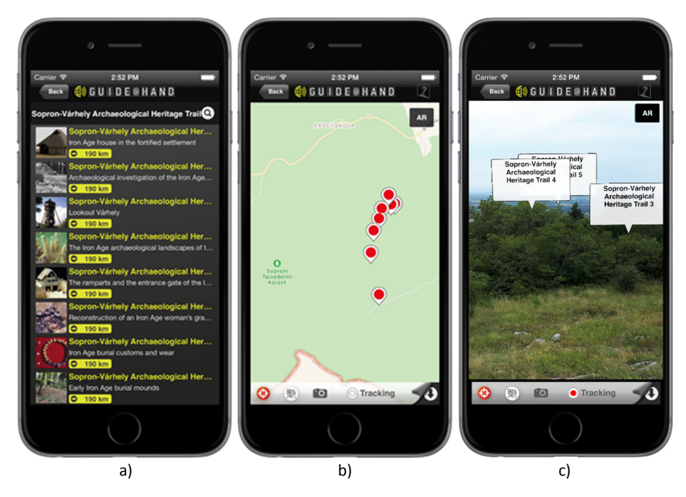
Fig. 5. a) A walk presented in a list mode. b) A walk presented on a map. c) A walk presented in AR mode.