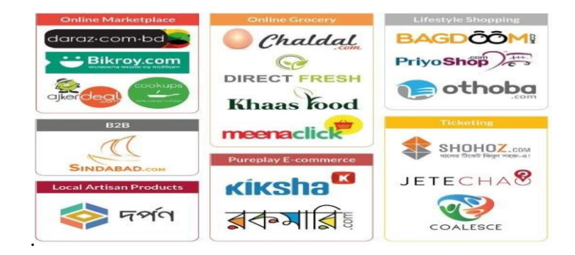
Table: 1 E-commerce platforms of Bangladesh

now operating and performing admirably alongside foreign firms. Amazon has recently established a presence in Bangladesh and is conducting business there.