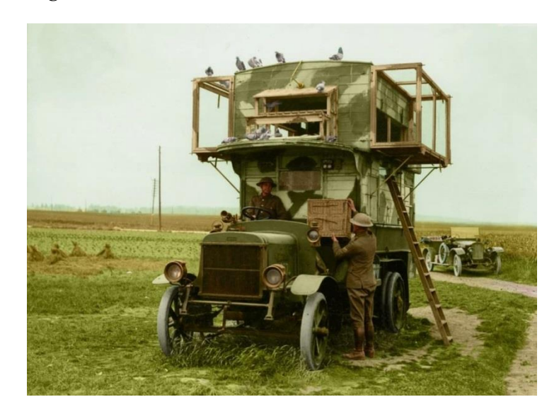
Fig. 2. Mobile pigeon station

Pigeonries were divided into permanent pigeon stations (base stations) and field (demountable) ones, i.e. stationary and mobile stations, respectively (Figure 2). A base military pigeonry was sited in a spot where it could be visible to the bird from its eye view, one where the pigeonry ideally would be safe from being hit by enemy artillery fire. Permanent pigeon stations would normally be built for 125 couples of pigeons, while, for ease of catching, a pigeonry's internal height would reach six to seven feet (1.8–2.1 m) (Pochtovoe golubevodstvo, 1901: 48-54).