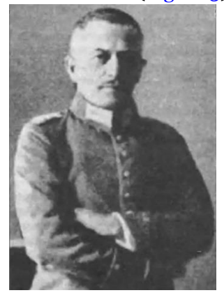
Fig. 3. Colonel W. Nicolai (1873–1947)

During World War I, the opposing sides made active use of messenger pigeons for prompt delivery of information. However, during the war's final period, they were also employed by the English and the French for intelligence and propaganda purposes. Of interest in this context are the reminiscences of Chief of the Intelligence Service of the German High Command Colonel Walter Nicolai (Figure 3).