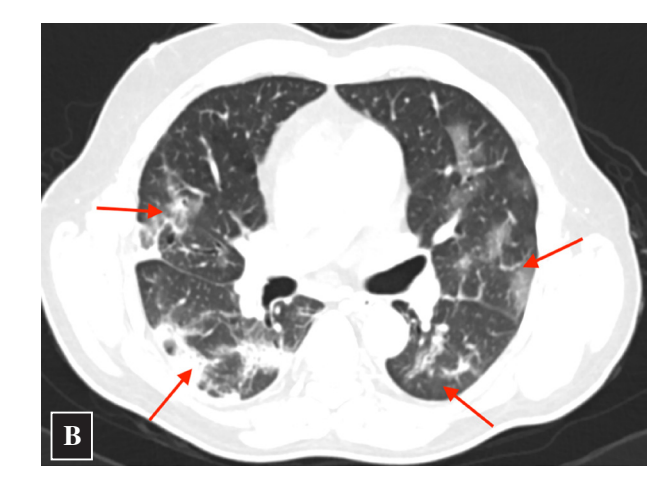
Figure 1. The CT images of a 63-year-old COVID-19 patient with pancreatitis. (A) Mild diffusely enlarged pancreas with peripancreatic fat stranding (red arrow), suggestive of acute interstitial pancreatitis. (B) Multifocal patches of discrete and confluent ground glass opacities and consolidation within apicobasal and anteroposterior gradient in bilateral lung parenchyma (red arrows).

hypertriglyceridemia, hypercalcemia, smoking, gallstone, or abdominal surgeries. The patient's vitals and blood pressure were low with a respiratory rate of 30/min (normal: 10-20/min). Oxygen saturation was maintained through anasal cannula. The abdomen was non-distended but tender.