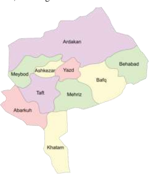
Figure 1. The geographical map of the cities of Yazd province in Iran

Area 10 includes: Qasem Naghi - Dehno - Seyed Mirza - Mohammadabad - Fahraj