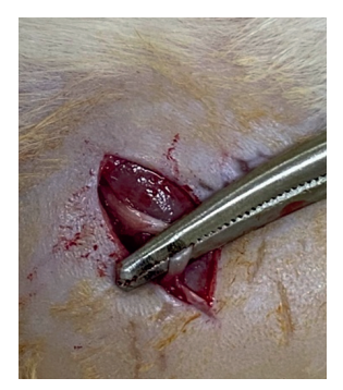
Figure 1. The compression of the sciatic nerve at a position 5 mm from the tip of the forceps.

The IgG levels were measured at 5 mm from the distal nerve lesion. The sciatic nerve tissue was homogenized in 600 \mu L PRO-PREP solution. Furthermore, cell lysis was induced by incubation for 20-30 minutes in a refrigerator at -20°C. Centrifugation was carried out at 13,000 rpm at 4°C for 5