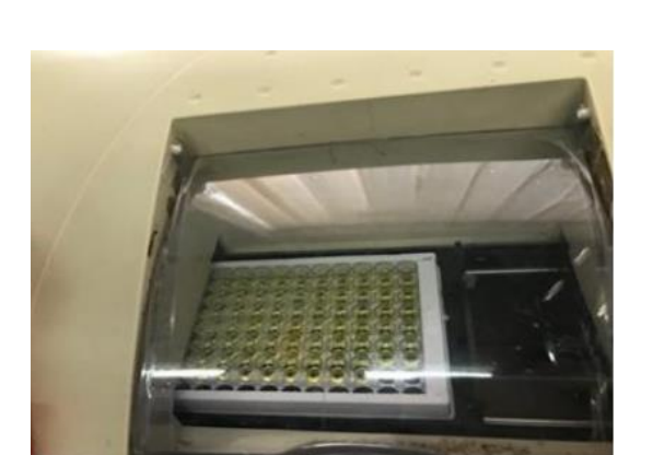
Figure 3. ELISA Plate Reader, in order to read the absorption of the wells