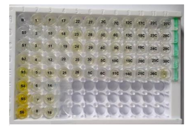
Figure 4. Rapid color change from blue to yellow after adding stop solution