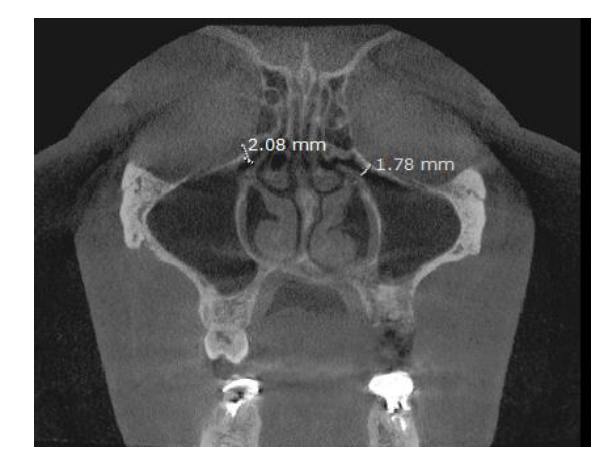
Figure4. Measuring the infundibulum in CBCT coronal view (white line on both sides indicates measured length)

For measuring the size of the infundibulum, the diameter of the infundibulum was determined in the coronal plane at a distance of 1 mm from the maxillary sinus ostium (Figure 4).