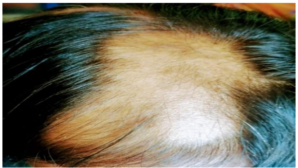
Figure 1 Before treatment

Marked improvement was observed during the course of treatment and follow up period. The same is depicted in Figure No. 1, Figure No. 2, Figure No. 3, Figure No. 4, Figure No. 5 and Figure No. 6