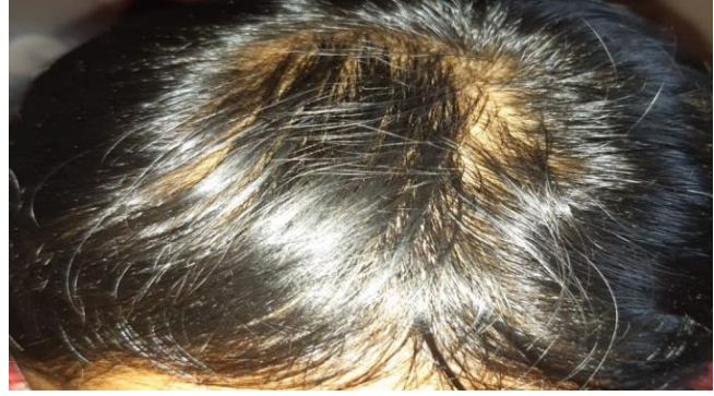
Figure 6 During second follow up