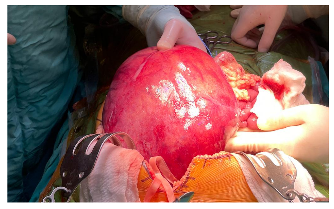
Figure 2. After laparotomy, gross hepatomegaly was detected. DISCUSSION

notransferase and aspartate aminotransferase of 389 U/L and 126 U/L, respectively). After day 3 of ICU follows up, she was discharged at 6 th postoperative day on the ward, with close follow-up as an outpatient.