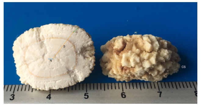
Figure 1. Struvite urolith layers. N = nucleus or nidus, S = stone or body, C = cortex or shell, CS = surface crystals.

urinary stone into a fine powder. The uroliths were classified according to the amount of mineral they contained; they were considered as "pure" when they had more than 70% of a single mineral, "mixed" with less than 70% of a single mineral and "compound" when the urolith had layers of different mineral composition (1). The uroliths' chemical compositions were determined by infrared spectroscopy (FT-IR Spectrum 2, PerkinElmer, USA) with a diamond ATR. For the quantitative analysis of the different minerals, an electronic reference library of spectra (NICODOM IR Kidney stones 1668 spectra Nikodom, Czech Republic) was used.