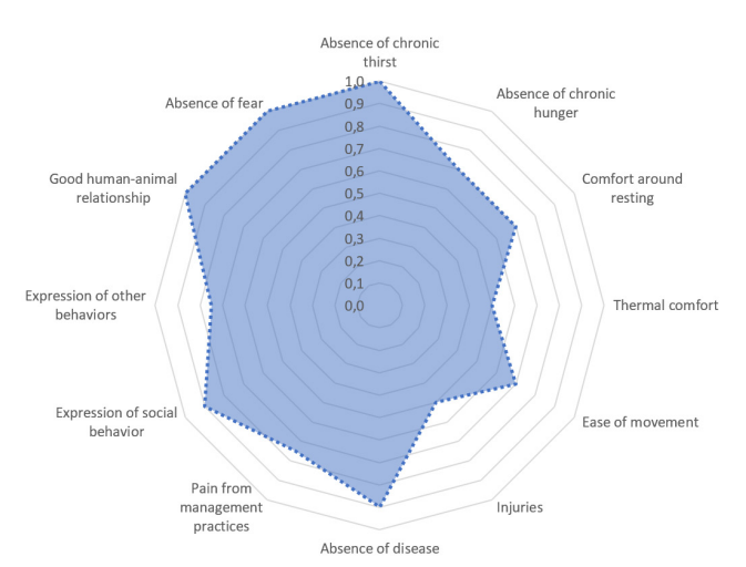
Figure 2. Welfare indicators for piglets from the analyzed production units.

practices. This is shown in the results of the Spearman's R correlation, where there was a negative correlation between the variables of animal welfare and the variables of tail docking (-0.824, p=0.002) and number of pigs destined for fattening (-0.803, p=0.005), indicating lower animal welfare by having a higher number of pigs and performing activities such as tail docking.