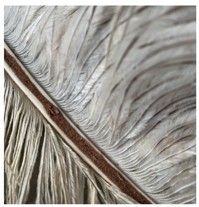
Figure 1 . Presence of mites, with the aspect of "brown colored dust" on the feather's rachis.

seen from the back or dorsal point, posterior lobes (pl) with suction cups (sc), bifurcation (b) of the posterior lobes and two long sensillum on each lobe. Female (Figures 2B): TL ~800 μm, presence of a forward plate (fp) and a posterior plate (pp) shows a polygonal pattern seen from the dorsal point, genital pore (qp) and 4 long sensillum on the posterior border of the idiosome without bifurcation. Nymph (Figures 3A): LT ~600 µm. Presence of: forward (fp) and posterior plate (pp) with polygonal pattern seen from the dorsal point and four long sensillum in the posterior edge of the idiosome. Larva (Figures 3B): TL ~300 µm, presence of three pairs of legs, a forward plate (fp) and a posterior plate (pp) with polygonal pattern viewed from the back and two long sensillum in the posterior edge of the idiosome. Additionally, there is a similarity in sizes in all pairs of legs throughout different stages of development (13,14).