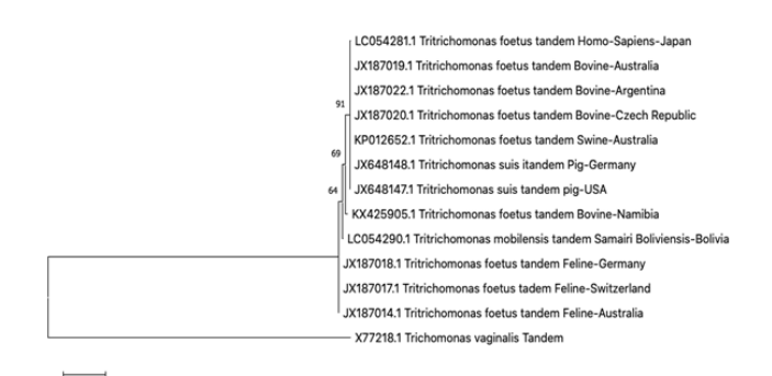
Figure 2: Phylogenetic tree using maximum likelihood and Bootstrap based on tandem sequences of cysteine-proteases CP1, CP2, and CP4 from Tritrichomonas spp., and Trichomonas vaginalis as an outgroup.

Finally, the tandem sequence focusing on giving a global overview of the relationships from the three cysteine-protease genes of Tritrichomonas spp. allowed improving the strength of the relationships and the separation of Tritrichomonas spp. isolated from cattle and pigs in a different group from the one comprised of those isolated from cats, bovines from Namibia, and primates (Figure 2).