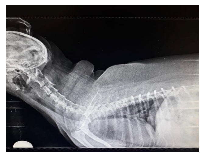
Figure 1. Right lateral-lateral radiograph of the neck and chest of the patient. The trachea presents a decrease in diameter at the cervical level, entrance to the thorax indicating a collapse.

at 12 months of age in the reference clinic. The initial clinical signs were cough, snoring (which increased over time) and exercise intolerance. The patient was intermittently treated with anti-inflammatory therapies (corticotherapy), antibiotics, and bronchodilators. The owners observed that a slight improvement with medical therapy, but with the passing of the days their respiratory problems worsened. The day was presented the episode, the patient barked for several hours, continuing an intense cough that generated severe respiratory dyspnea, requiring treatment with oxygen and dexamethasone. The thoracic radiograph revealed TC (Figure 1), so the patient was referred for a more thorough evaluation of the veterinary center Mastervet with subsequent treatment.