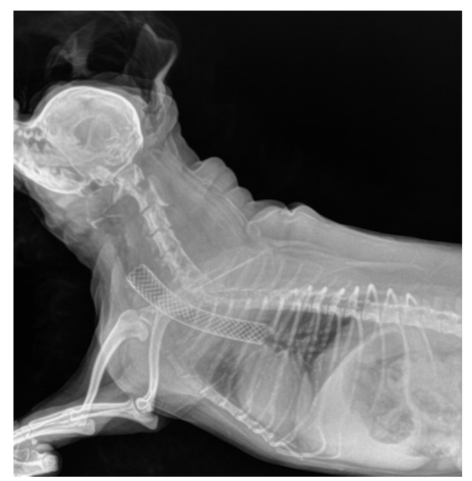
Figure 4. Right lateral radiograph of the neck and thorax after stent placement. Stent radiopaque object with endoluminal location in the trachea, from the middle cervical portion to the thoracic portion of the trachea.

The use of oxygen was not necessary in the patient's postoperative, since the recovery from anesthesia was successful and his breathing went from severe inspiratory and expiratory distress that he presented before surgery, to normal after the procedure.