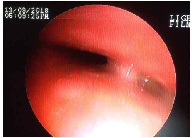
Figure 2. Bronchoscopy view of the patient, showing a severe degree of collapse of the trachea at the cervical and thoracic levels.

mucosa, besides, dynamic collapse of the left main bronchus (bronchial collapse) (Figure 2).