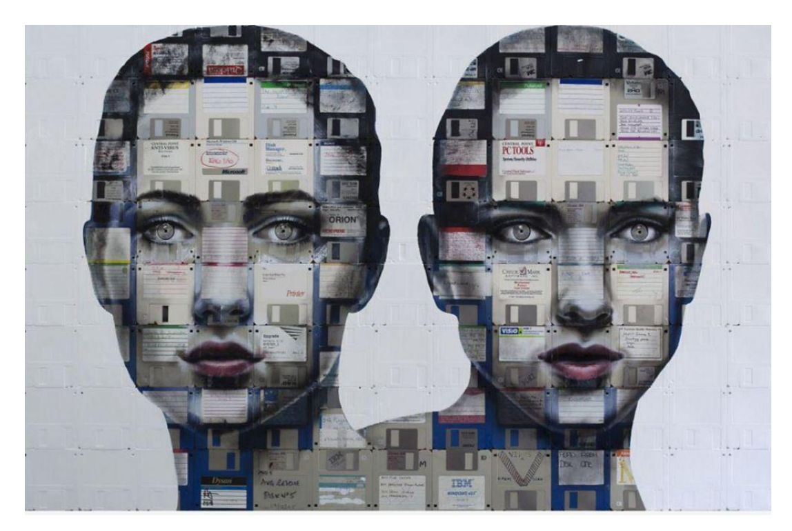
Image -8, Artist - Nick Gentry, [source of image - arte8lusso.net ]