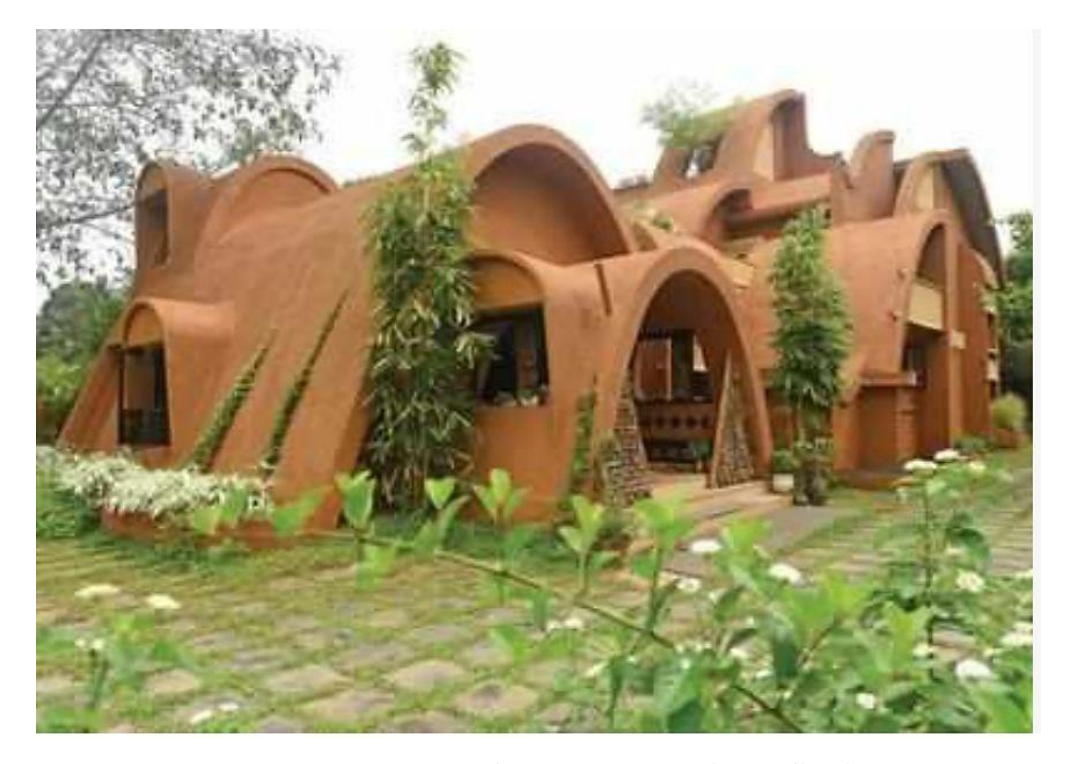
Image -3, Mud House, Kerala

. Earth Is one of man's oldest building materials and most and share civilizations used in some form. It was easily available cheap and strong and required only simple Technology . In Egypt The Grain stores of Ramassume building built in Adobe in 1300 BC still exist ,the Great Wall of China has sections built in rammed earth over 2000 years ago . Iran ,India ,Nepal, Yemen all have examples of ancient cities and large buildings built in various forms of earthen Constructions. History repeats itself nowadays. There is a craze for mud houses in hotels, restaurants , guesthouses , and for personal homes also . Kerala based Architect G Shankar mud house at Mudavanmugal in Thiruvananthapuram, is the eye catching 3000 square feet mud house near banks of Vellayani lake. [image - 3]