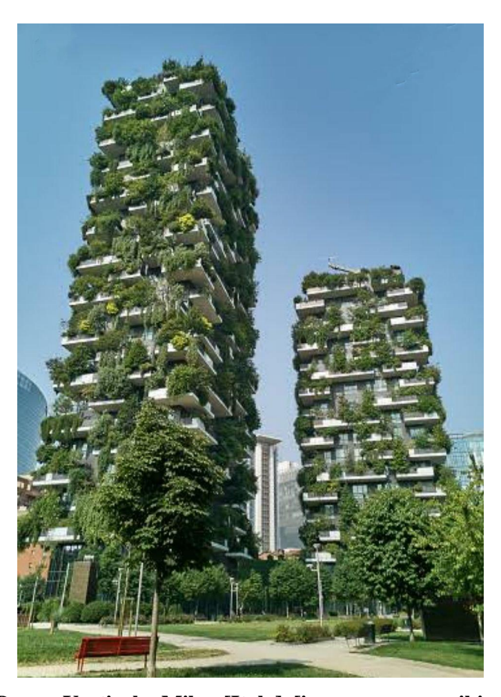
Image -2, Bosco -Verticale -Milan [Italy], [image source - wikipedia -e net ]

The buildings biodiversity is expected to attract New birds and insecst species to the city . It is also used to moderate temperatures in the buildings in the winter and summer by shading the interiors from the sun and blocking Harsh winds . The vegetation also protects the interior spaces from noise pollution and dust from street level traffic. The building itself is self-sufficient by using renewable energy from solar panels and filtered Waste water to sustain the building's plant life; these green technology systems reduce the overall waste and carbon footprint of the towers . [image -2]