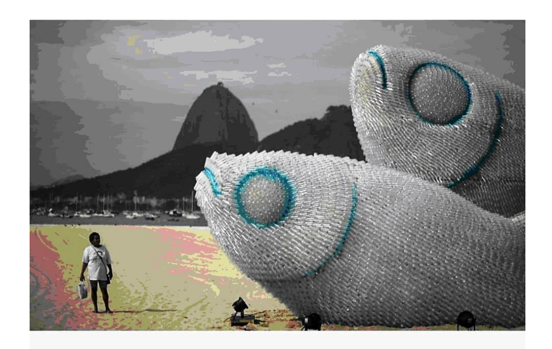
Fish installations from plastic bottles,

Andre Brossil [Ecofuturist Artist ]creating a unique piece of art, the spherical Sun power generator, i s not just an artistic interpretation of renewable energy but it is also a renewable energy invention. The sculpture is a structure that generates twice the Normal amount of solar energy possible with the Solar Panel this also works using significantly less surface area we can use this invention to charge an electric car or serve as a high power lamp at night.<sup>10</sup> [image -7]