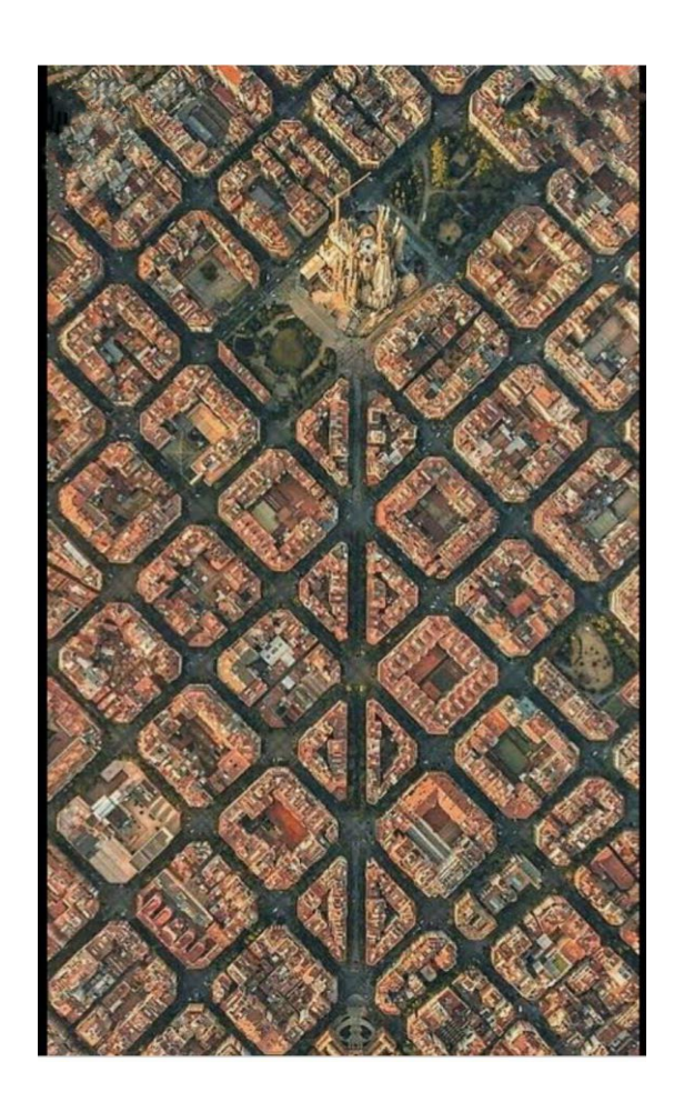
Image - 4 , Barcelona City - Spain Land Art

And second, his plan embodied what is - then and today- a striking egalitarianism . Each block [manzana] was to be of almost identical proportions, with buildings of regular height and spacing and preponderance of green space. Commerce was to take place on the ground floor , the bourgeoisie were to live on the floor above[ rather than and mansions at the edge of town and the workers were slated for the upper floors . In this way they would all share the same streets and public spaces, exposed to the same hygienic conditions , reducing social distance and inequality . [ image - 4]