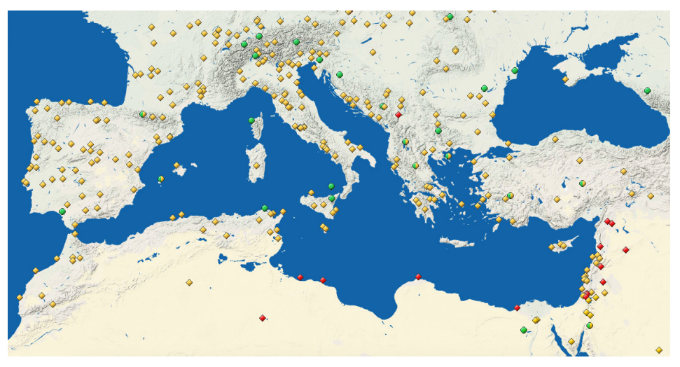
Figure 1. Mediterranean UNESCO Cultural and Natural Heritage (UNESCO WHC, 2017). Sites at risk or threatened are shown in red colour.

tion, and the social impacts of sites; the second one, which is close to the idea of Sustainable Development, concerns the protection policies and the future enjoyment of the assets, in their present-day conditions.