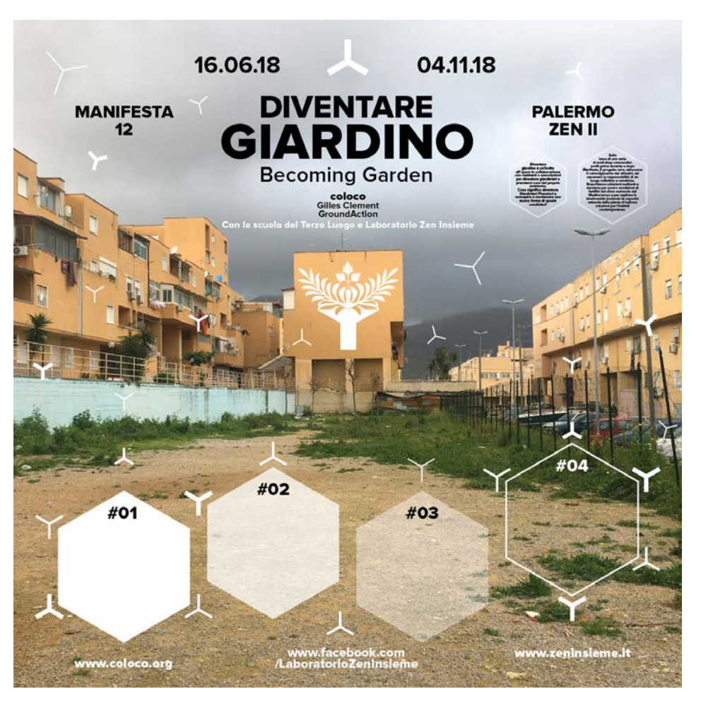
Figure 1. The poster of the work in progress during the opening period of Manifesta, June 2018.