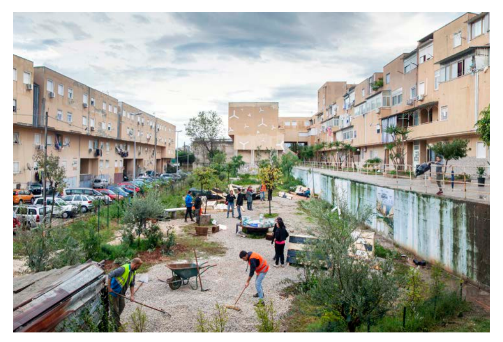
Figure 10. The third intensive workshop at the closing of Manifesta, November 2018.