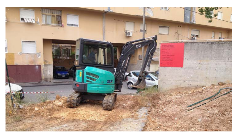
Figure 3. The construction begins during the opening of Manifesta. The first drawing was made directly on site with the excavator, June 2018.