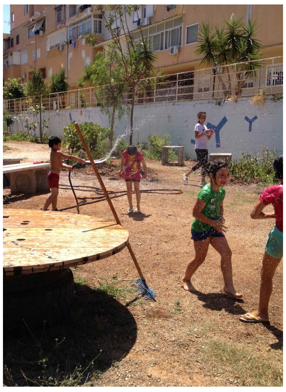
Figure 8. Learning by doing, it is a challenge and a game at the same time, August 2018.