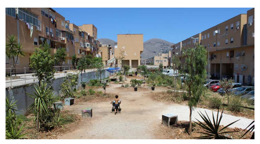
Figure 6. The state of the garden at the end of the second workshop, June 2018.