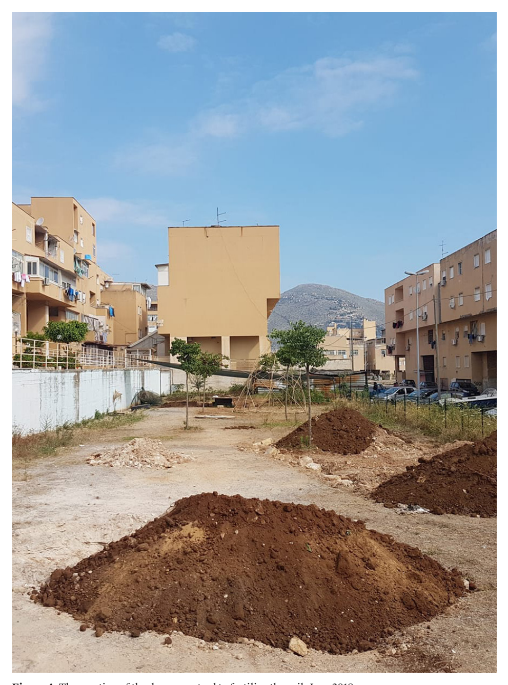
Figure 4. The creation of the dunes as a tool to fertilize the soil, June 2018.