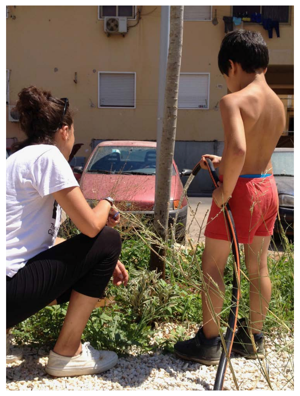
Figure 7. Care and maintenance are an educational practice in order to consolidate the relationships with local neighbors and gardeners, July 2018.