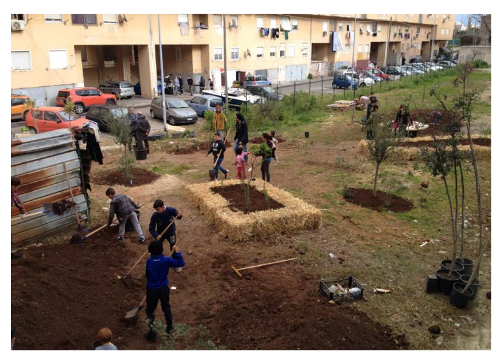
Figure 2. Test field during the first workshop with the community, March 2018.