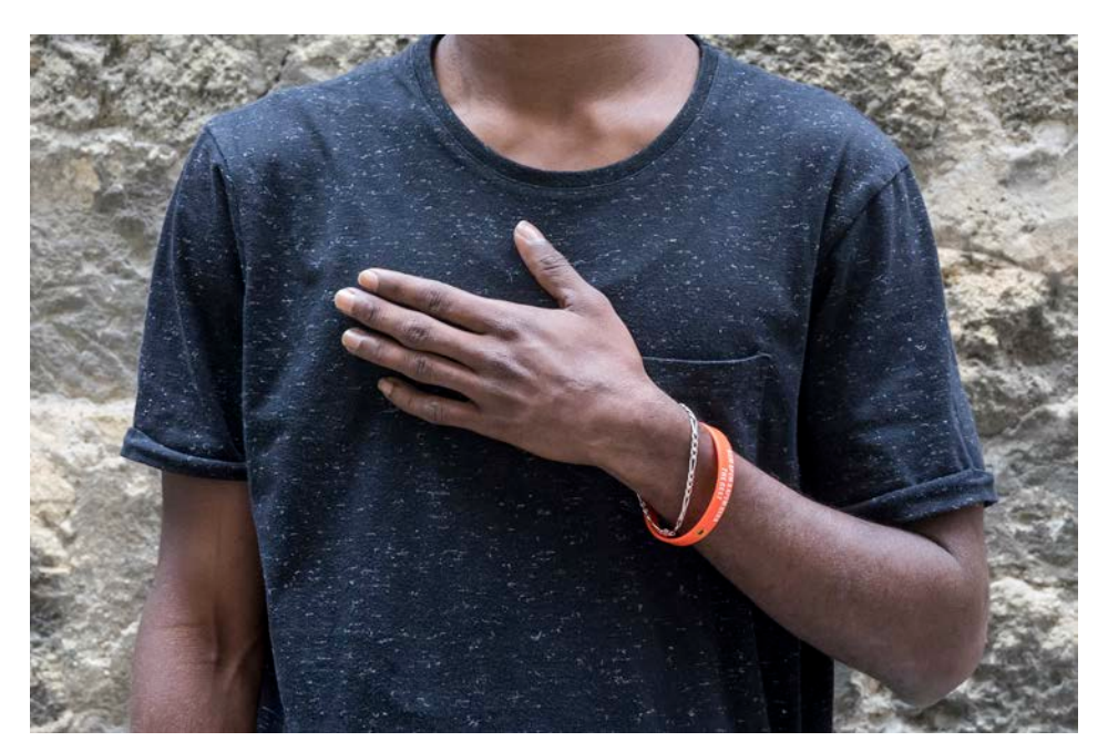
Figure 3. Bianco Valente, Baricentro , 2018, fine art print.