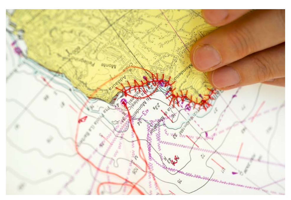
Figure 4. Bianco Valente, Coastline (Gulf of Palermo), backstage, 2016.

finite shades of colour that the cradle of western civilization can take on, depending on when and where you look at it" (Valente 2018, p. 33). In the work we see a multitude of strips of paper cut out from pictures advertising tourist resorts and holiday destinations on the shores of the Mediterranean. A study in the use of colour in marketing, to give expression to the imagination that goes with choosing the more exotic travel destinations. The work, which has a strong aesthetic impact, succeeds in its aim of enchanting the viewer with the beauty of the shades of blue, which reflect the collective idealization of the sea. Another face of the landscape, which presents itself as an icon, and is deconstructed when we move closer to the work and perceive the nature of the piece.