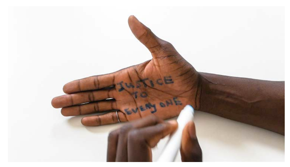
Figure 2. Bianco Valente, Baricentro , 2018, video, endless loop.