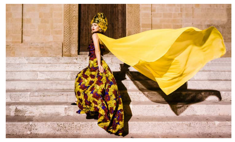
Figure 5. The school of trades of Silent Academy, Matera 2019.