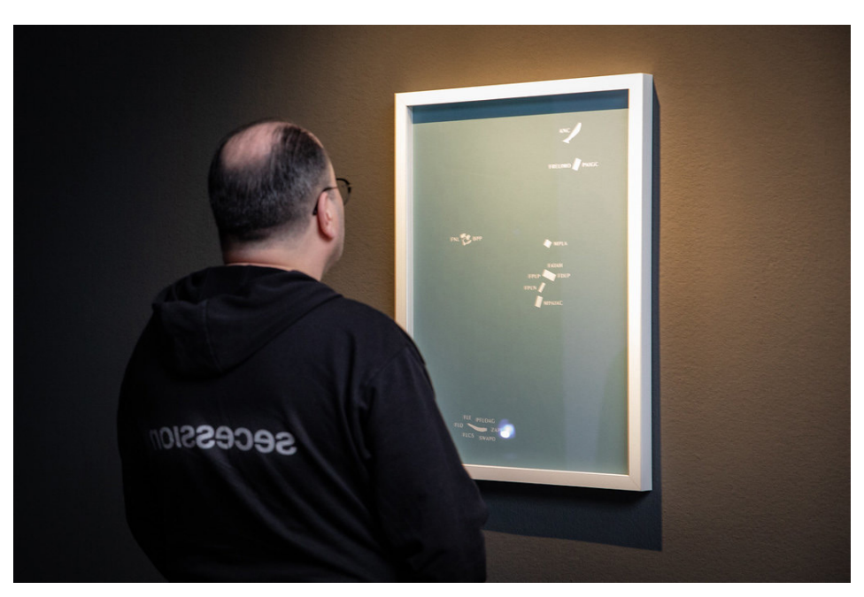
Figure 3. Lorenz Seidler, ESEL0866. Bouchra Khalili, The Constellations . Source: <a href="https://search.creativecommons.org/photos/d0d61378-b76c-46e0-9b4b-3249cb17cdcb">https://search.creativecommons.org/photos/d0d61378-b76c-46e0-9b4b-3249cb17cdcb</a>. "ESEL0866" by eSeL.at is licensed under CC BY-NC-SA 2.0

Her listening action is apparently neutral: Khalili, in fact, records these random encounters on video, without ever appearing or speaking and never framing the faces of her interlocutors, who, in these way, become pure narrative voices.