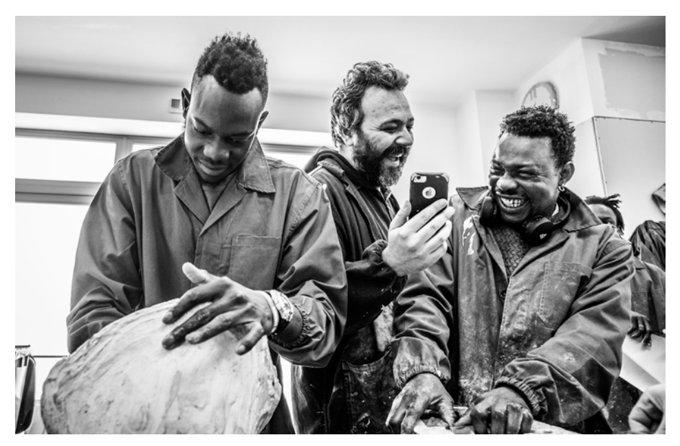
Figure 6. The school of trades of Silent Academy, Matera 2019.