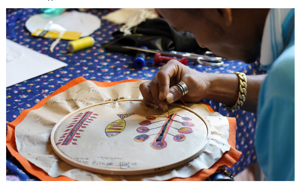
Figure 10. Crossings 2019.