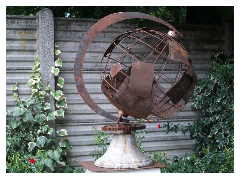
Figure 7. Roger Ranko, Mondo In Fame . Sculpture with iron recovered from disused industries (80x60xh93). Basa_Menti project, CityArt.