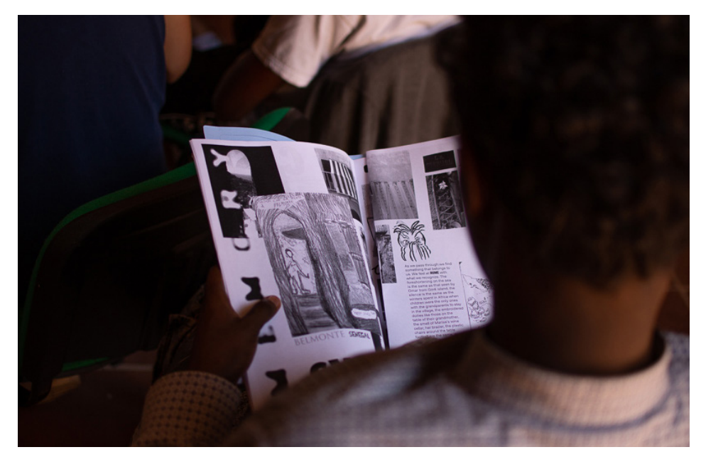
Figure 9. Crossings 2019.