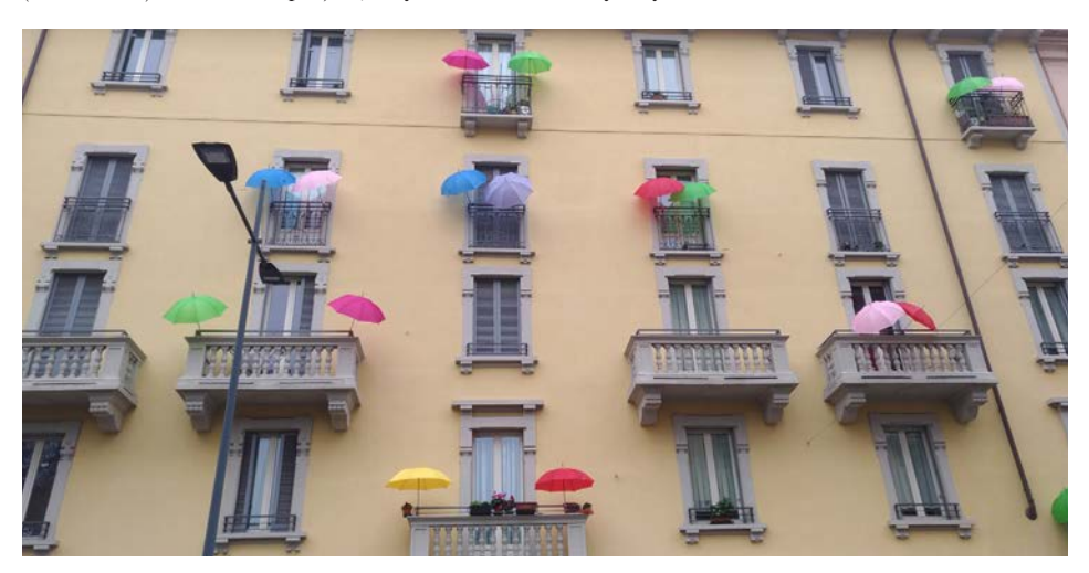
\textbf{Figure 8.} \textit{Contact\_Open (your) house project}, \textbf{CityArt. Façade colors.}