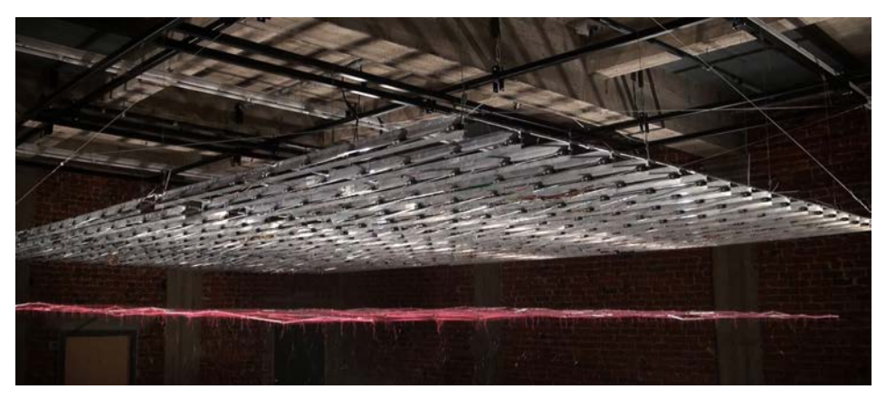
Figure 5. Underwater, David Bowen, 2012.

David Bowen's approach in Underwater (David Bowen, 2012) (Fig. 5-6), a large-scale kinetic installation, suspended, that takes shape and comes to life nourishing itself with data deriving from the movements of the water surface in Lake Superior (North America), supports a design direction attributable to what Bihanic calls "praxis value". In fact the simulation of water motion is generated in real time by the operation of 486 servomotors, as well as providing remote physical evidence, it facilitates the search for new methods, techniques and processes of analysis of the data produced. Also, by Bowen, Tele-Present Water (2019) consists of the plastic evocation of a remote dynamic topography. Even in this case it replays the movement of a part of the Pacific Ocean thanks to the real-time transmission of the recordings made by the sensors placed on a buoy by the National Oceanic and Atmospheric Administration (NOAA).