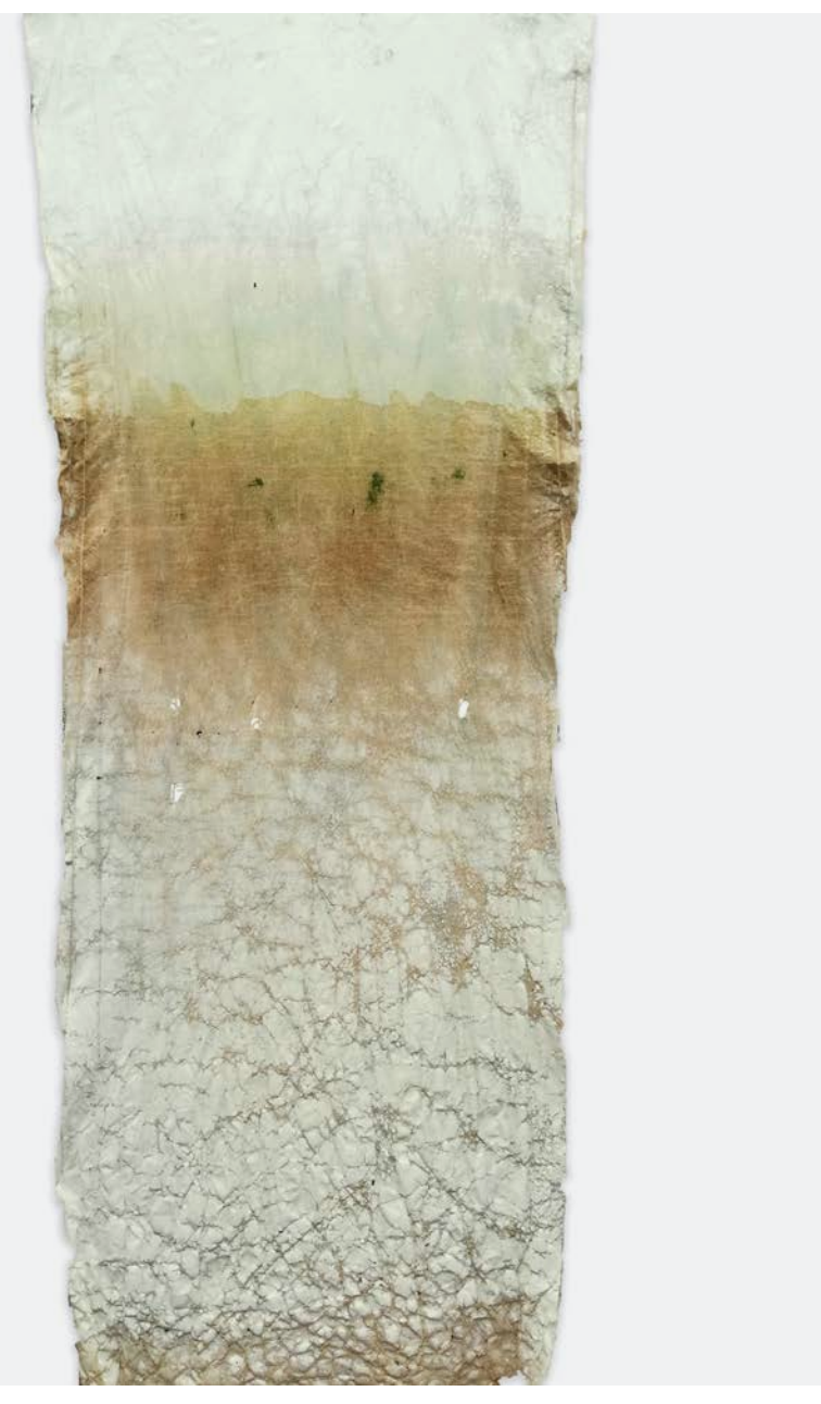
Figure 1. Tracce di Marea , Federico Polloni, 2019, from the research of Georg Umgiesser et al. entitled Verso l'omogeneizzazione delle lagune Mediterranee e perdita della loro biodiversità .