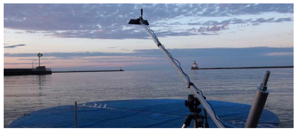
Figure 6. Underwater, David Bowen, 2012.