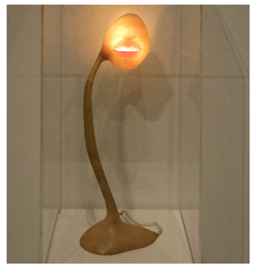
Figure 1. Alina Szapocznikow, Lampe-Bouche , 1966, Coloured polyester resin, light bulb, electrical wiring and metal.

into the disappeared modernisms of post-war Eastern Europe. Szapocznikow had many artistic relations to little known Czech sculptors such as Eva Kmentová (1928-80) and Vera Janousková (1922-2010) who need to be reconsidered within the contemporary representations of femininity.