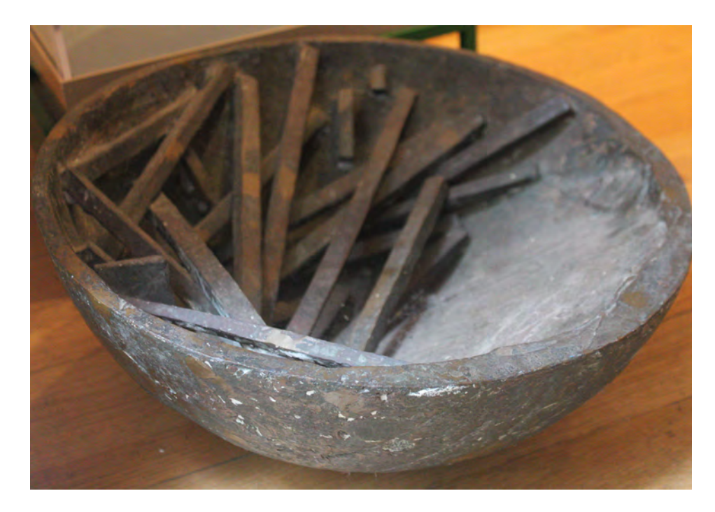
Figure 3. Ruth Vollmer, Cosmic Fragments , 1962, Bronze, Jack Tilton Gallery, New York.

The essence of her work lies deeply in her constructions and architectural objects. Based on mathematical models, Vollmer's Steiner Surface (Fig. 2) "dipped in its integument of translucent acrylic, which clings lightly and softly to the ribs of the form, it is just as delicately refined and as seemingly immaterial and object as the Gabo" (Vallye, 2006, p. 101). She employed a geometrical vocabulary transferred into a cosmological realm. For instance, Cosmic fragments (Fig. 3), "the Ovaloids, Walking ball and Obelisk all reflect a modernist equation of art and subjectivity, the kind of surrealist engagement with psychic themes that preoccupied European artists" (Swenson, 2006, p. 96).