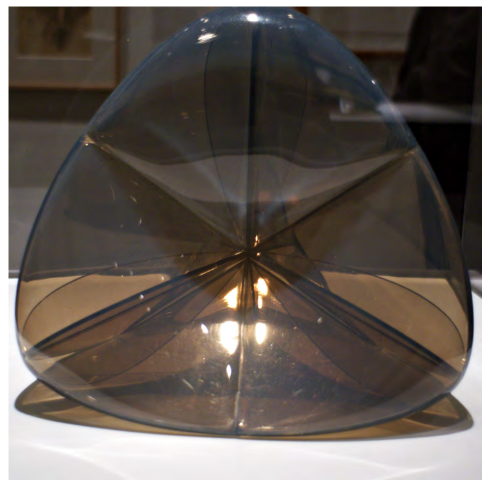
Figure 2. Ruth Vollmer, Steiner Surface , 1970, Acrylic, collection Dorothea and Leo Rabkin.