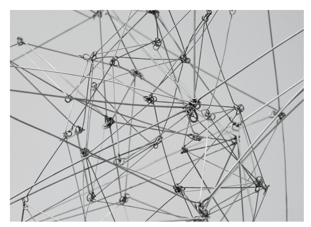
Figure 8. Gertrud Goldschmidt (Gego), Esfera No. 2, 1976, Wire and stainless steel, Fondation Cartier pour l'art contemporain, Paris. Photo by Barbara Smith, 2018.

Following the Bauhaus, Gego and Vollmer were draftswomen, artists and designers. They reinvented the materials and the structure into a mode of self-empowerment and in new theoretical categories that transcend the modernist trajectory. In fact, the 2019 that marked the 100<sup>th</sup> birthday of the Bauhaus encouraged to revise the strong gender bias at the base of the Bauhaus school and started to recognize many female members of the school.