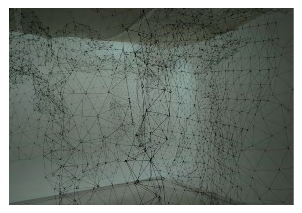
Figure 6. Gertrud Goldschmidt (Gego), Reticulárea , 1969, Aluminum and stainless steel wire, Museo de Bellas Artes, Caracas.