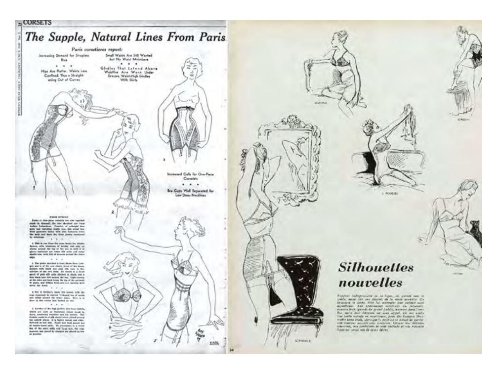
Figure 10. On the left: Women's wear daily, 1949. On the right: L'Art et la Mode, 1947.

A great deal of interested is sparked by the innovative products in the sector's publicity, and which also interests some of the main newspapers, both journalistic and fashion, on an international level: Le Gaulois, Excelsior, New York Sun, Chicago Tribune, L'Officiel de la Couture et de la Mode, L'Art et la Mode, Vogue Paris, Vogue USA, etc. (Fig. 10).