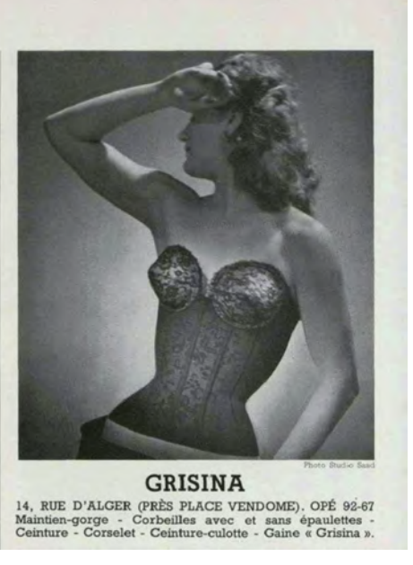
Figure 7. On the left: Henry Clarke, Grisina bra, 1949. On the right: Studio Saad, Grisina corset, "L'Officiel de la Mode", n° 357/358.