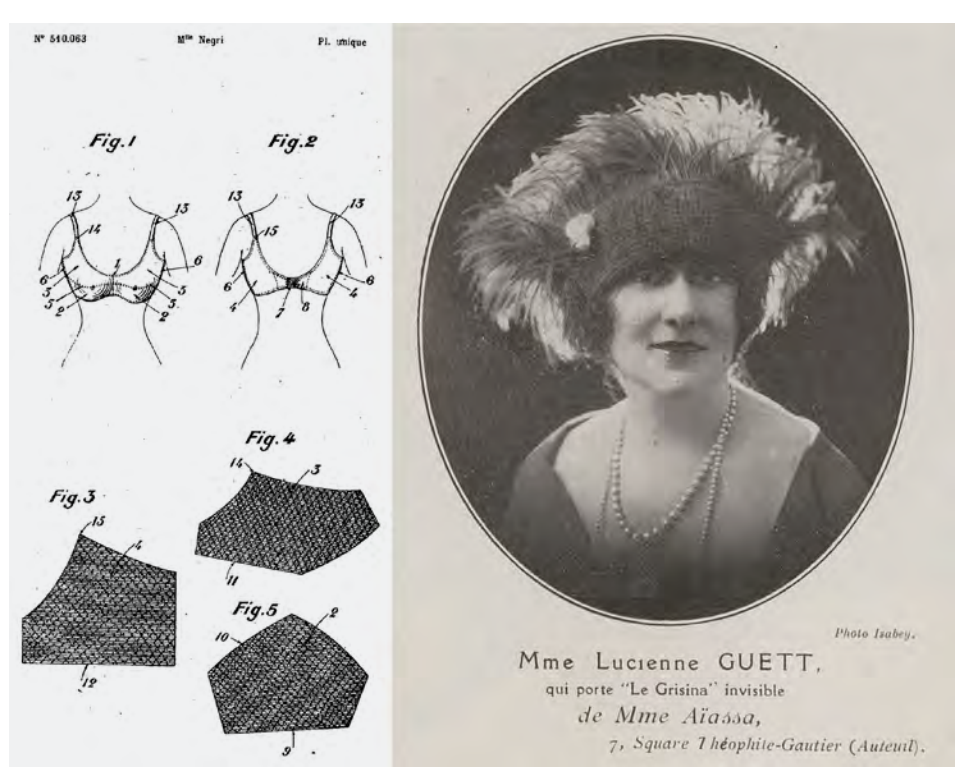
Figure 3. On the left: Teresina Negri, drawings from patent, Paris, 1920. On the right: Grisina advertisement, Comoedia Illustré , 1920.

respectivement dans chacune des deux poches qu'il forme et cela sans le secours d'aucune baleinage ni d'aucune bande de renforcement, mais simplement par l'assemblage par couture rabattue et piquée, de trois pièces de tissu convenablement coupées composant chacune des moitiés du soutien-gorge symétriques par rapport au milieu de la poitrine<sup>9</sup>. (Fig. 3)