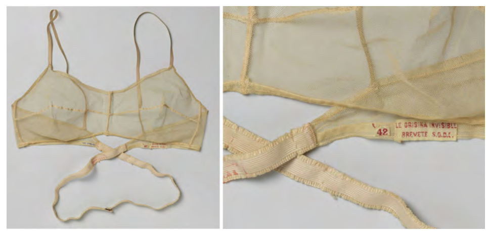
Figure 2. Brassiere with a Low-Cut Back, Grisina, c. 1926 - c. 1932. Rijksmuseum, Amsterdam.