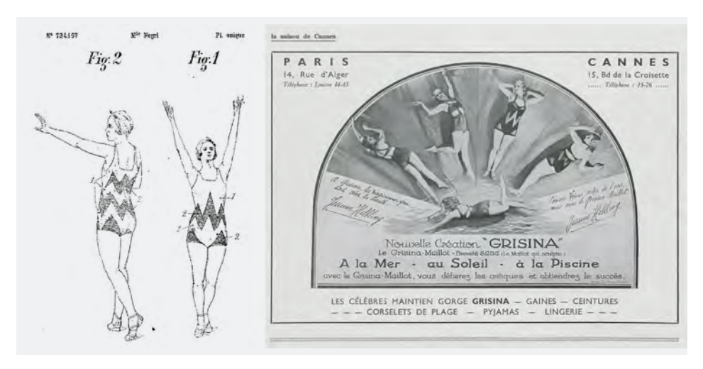
Figure 9. On the left: Teresina Negri, drawings from patent, Paris, 1932. On the right: Grisina advertisement, La saison de Cannes , 1932.