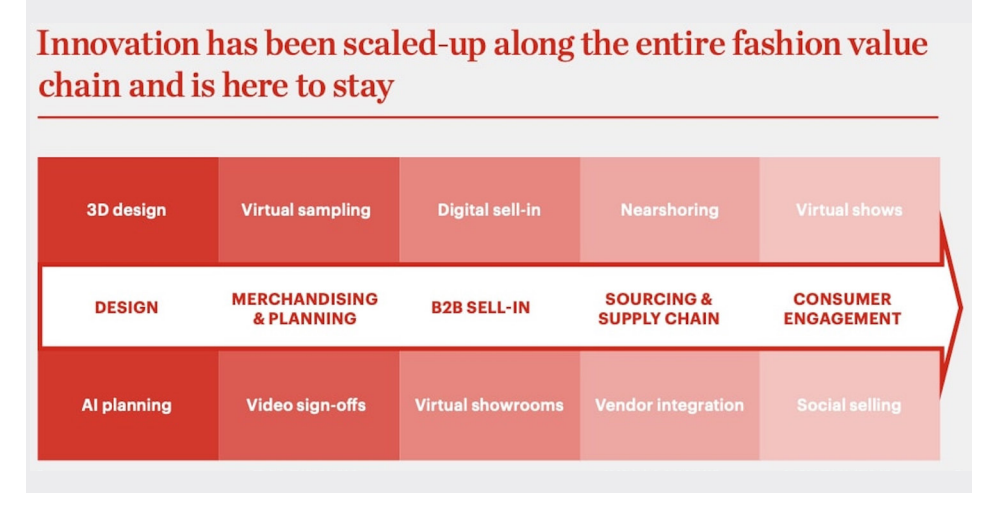
Figure 1. Innovation has been scaled-up along the entire fashion value chain and is here to stay, BOF, 2020.

It is the alchemy that perceives design as a proactive element of responsibility in the confrontation between people and society, as well as a necessary component in the innovation process (Fig. 1) and an indispensable resource for inducing and improving competitive strategies (Franzato & Celaschi, 2012; Bonsiepe, 2011). Thanks to the intrinsic capacity to transform itself to adapt to society's changes, supporting changes, or even anticipating them, the design is the motto for economic growth and positive consequences for the socio-cultural fabric. It is clear that to achieve these results strategically, the significant contribution of all stakeholders involved is necessary: government, business people, designers, employees, consumers.