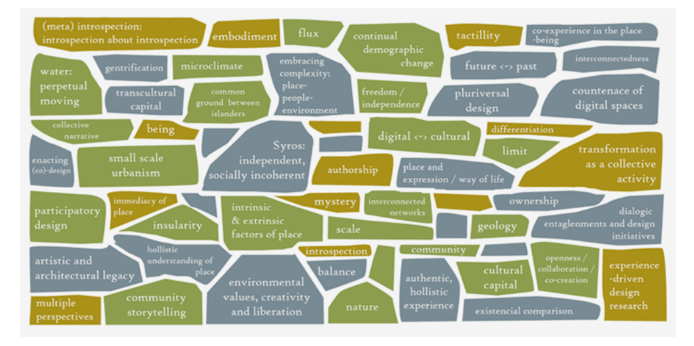
Figure 6. Authors, Xerolithia Theme Representation – Creating a stronger whole by combining our contributions All rights Authors.

Some emergent ideas that act as undercurrents connecting our experience and practice include the notion of temporality of space and place. Degrowth (Giacomo D'alisa et al, 2015) calls for decentralization, living on a scale that allows the place to exist. There is a rhythmical flow to the place that is connected to the climate, the mitigations of humans and non-humans and all aspects of it. The wet cold of winter brings us closer to protect us while the hostile August sun pulverises those who steer away from the embrace of the sea. Another dimension is how the Networks evolve to Nets, the common nodes in the constellation of activists, artists and scholars capture the minds of any adventurous souls that happen to pass through the Cycladic Archipelago. Finally, we extend an invitation to our readers to come and experience and engage in a dialogue on placebeing in the Mediterranean, this type of work is only the beginning.