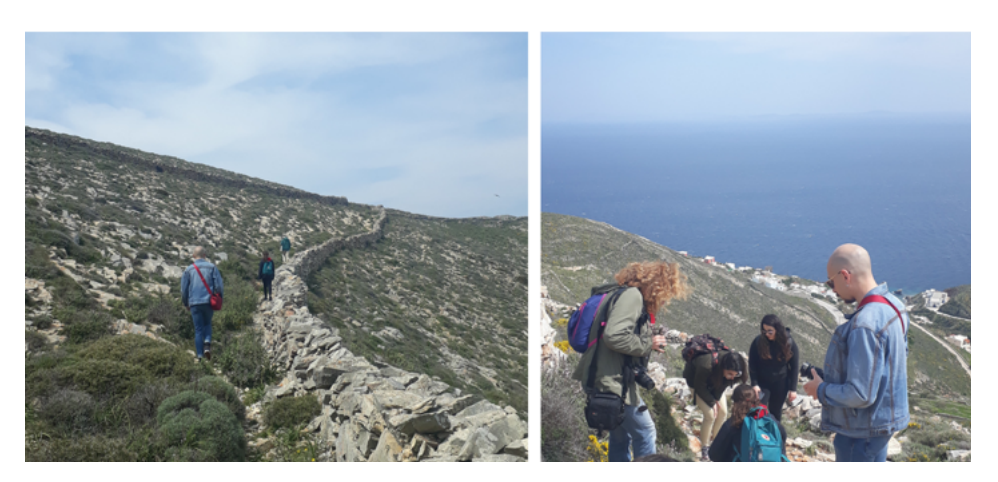
Figure 3. Walking through Apano Meria with the locals: discussing, exploring, understanding, and connecting with people and place.

All in all, in a world in the midst of several crises, systemic and collaborative design seems like the ideal kaleidoscopic lens through which humanity can engage in pluriversal (Escobar, 2018) problem framing. Discovering the multiple perspectives through which other entities experience this world, might help us tap into a collective wisdom that will guide us, more steadily, forward (Fig. 3).