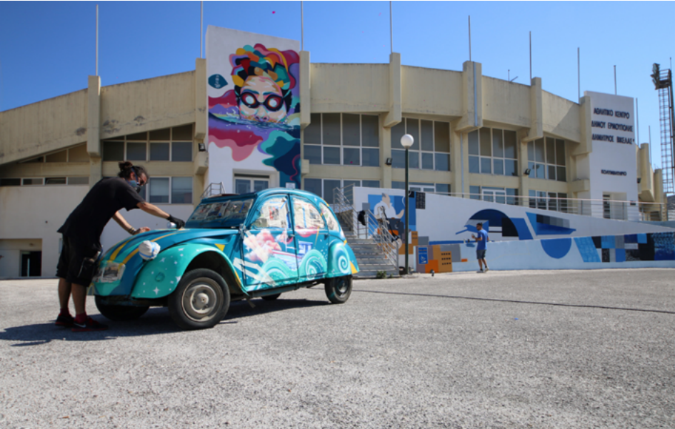
Figure 2. A small portion of the murals and artworks created at the Athletic Centre Dimitrios Vikelas of Syros during the Stray Art Festival 2018

play, a festival or a research process, everything is created by including a piece of the energy of this environment - this is what makes them stand out from the mass and the prefabricated. For an artist-designer like me, what life on a small island ultimately offers is the journey to the inner self. This journey, in addition to inspiration and creation, makes me understand my place in the world, humanity's granular scale in relation to the vast universe. Realizing that you are not unique is liberating. Life in Syros rewards me with the importance of scale. After all, all human actions, from a research process to a festival and from a play to a painting, are nothing more than stories. Even Design is storytelling (Lupton, 2017). Syros tells us how we will narrate it. In conclusion, place ( topos ) creates the way ( tropos ) (Fig. 2).