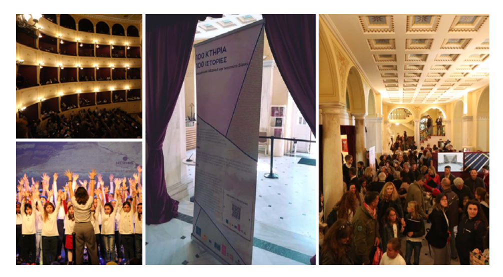
Figure 4. Celebrating the story-sharing initiative, '100 buildings / 100 stories", at the local historic theatre of Apollon, Hermoupolis.

In our research approach, we extend Heidegger's concept of placebeing and search for digital interactions among citizens and buildings highlighting the notions of place- belonging, acting, and making, thus focusing on the cultural expressions. Through such an approach one can suggest the thinking through the place which, eventually, indicates a way ( tropos ) (Fig. 4).