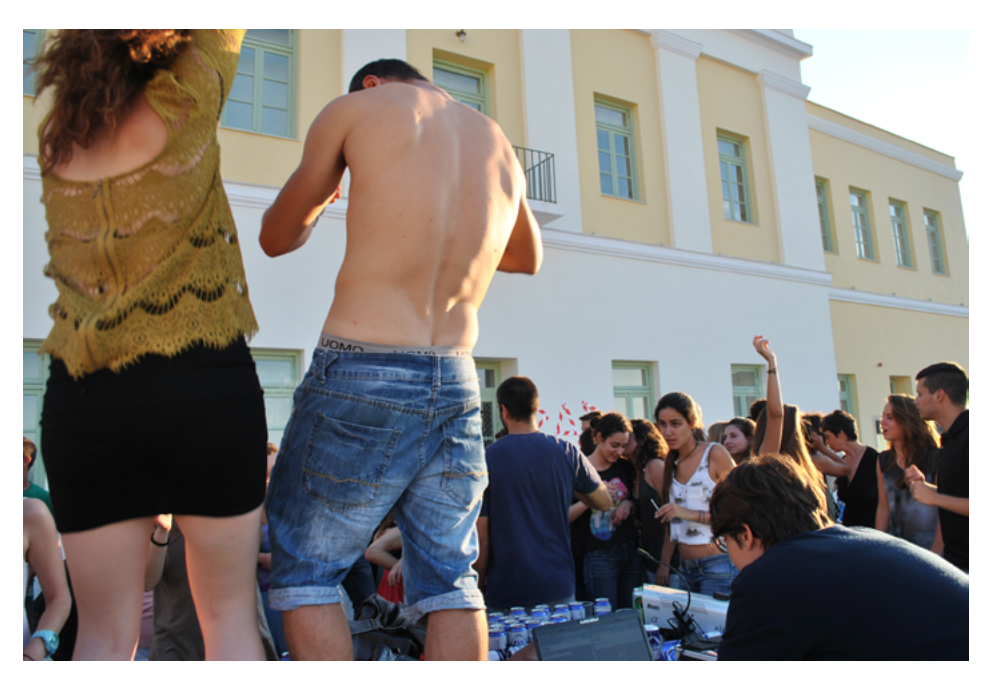
Figure 1. Daybreak at an all-night student party at the Department of Product and Systems Design Engineering.

I believe that the thing that helps is scale. The island is part of a holon called Cyclades which is part of a larger archipelago of the Aegean and so on. The opportunity to experience all the layers of human life in an explicit, unescapable way is what makes this a great place to do research. There are dimensions of this Mediterranean topos that are shared throughout mare nostrum yet some peculiarities unique to Syros. One is the constant demographic change with new refugees, expats and migrants increasing the plurality with each generation. Another constant is respect, any who come hoping to engage in cultural imperialism will be met with stiff resistance while those who acknowledge and work with the people of the island will be met with open arms (Fig. 1).