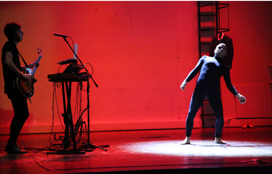
Figure 10. Habitans, curated and performed by rapso during CCI Days 2021 – Cultural and Creative Industries Festival produced by CRICC.

Although the data evidence a decent cultural participation and strong cultural networks, major cultural players have died out, the independent associations curator of the main festivals did not survive the COVID wave (Dipartimento Cultura e Promozione della Città, 2020) and policymakers continue to support only affiliated cultural operators and do not have the experience of those who build the events behind the scenes of power. The start-up phase of the Research Center for interaction with the Creative and Cultural Industries of the University of Bologna (CRICC) is placed within this context.