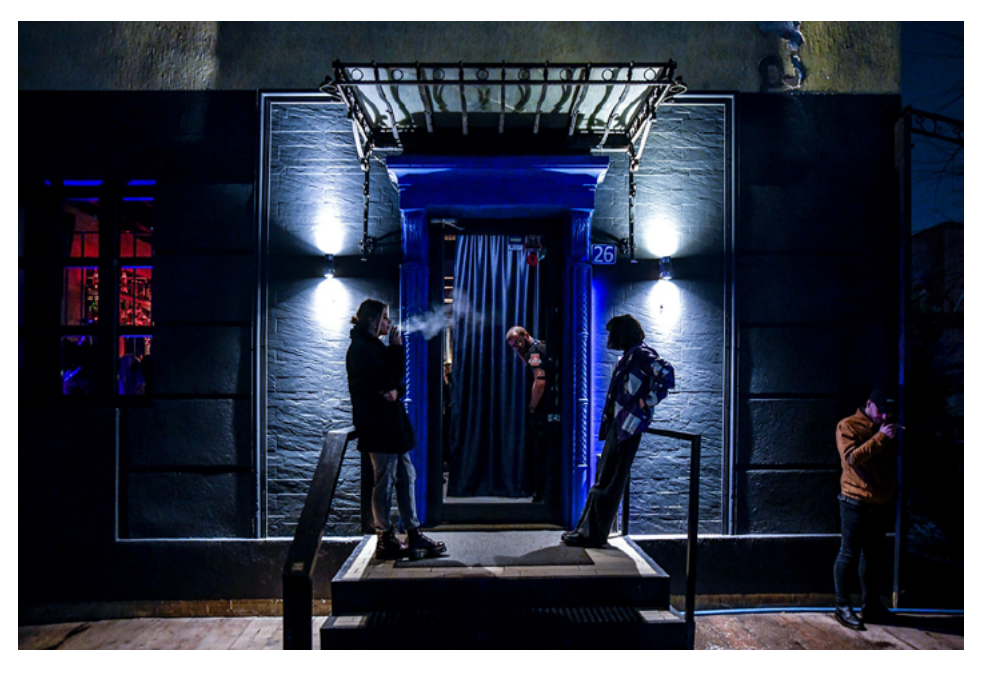
Figure 3. Pristina by night.

"When I decided to come back it was more of a temporary decision – I thought I'd go back to New York very quickly, but once I was here, I kept meeting people I was interested in, and who were interested in what I was doing" (Moshakis, 2012) (Fig. 3).