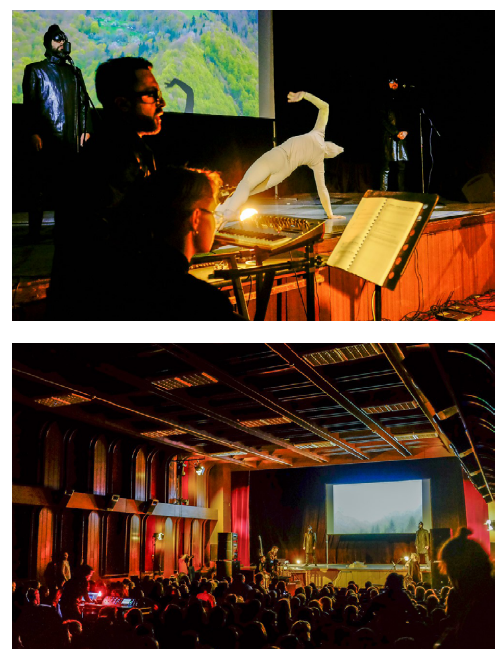
Figures 4, 5. Opera GOF, Kino Armata, Pristina 2019. "GOF" Opera is a physical and virtual journey of three characters that represent human condition in isolation.