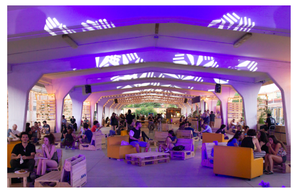
Figure 8. Summer--Time, DumBO Space, former railway yard Ravone, Bologna, 2020.