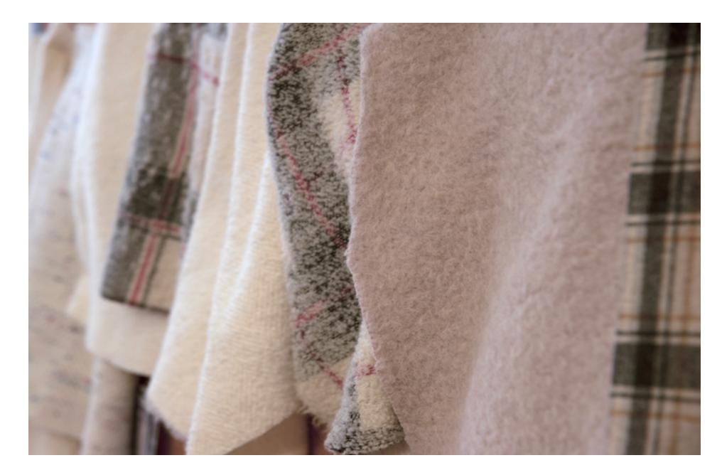
Figure 6. Carded textiles.

As an example of this rising interest in eco-fashion, we could mention the Green Carpet Fashion Award (GCFA)<sup>8</sup> in Milan. The event celebrates the best in a sustainable fashion. The awards reflect the commitment of fashion houses to sustainability, as they work to embrace rapid change while preserving the heritage and authenticity of small-scale producers. The project has been launched in 2017 in collaboration with Camera Nazionale della Moda Italiana (CNMI), adding glamour and celebrity to sustainability issues in a true Oscars ceremony style. Held every year at La Scala theatre in Milan, they are the only awards ceremony to honour both the handprint of fashion (the human