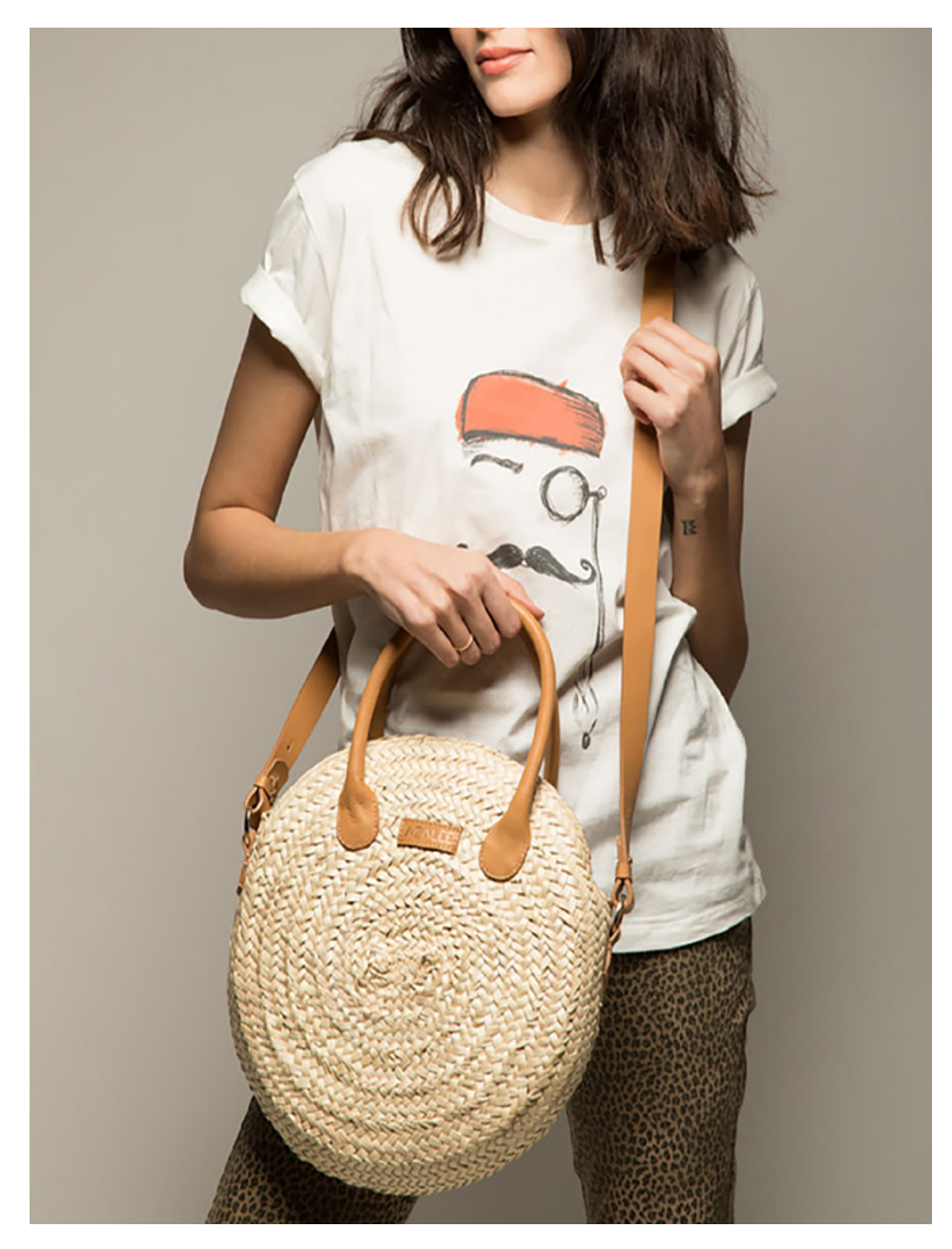
Figure 9. Azalée's weaved palm leaves handbag, collection Dalida, provided by the founder Amira Derouiche (retrieved from <a href="https://images.app.goo.gl/nToReWssVwLAxSBz5">https://images.app.goo.gl/nToReWssVwLAxSBz5</a>).