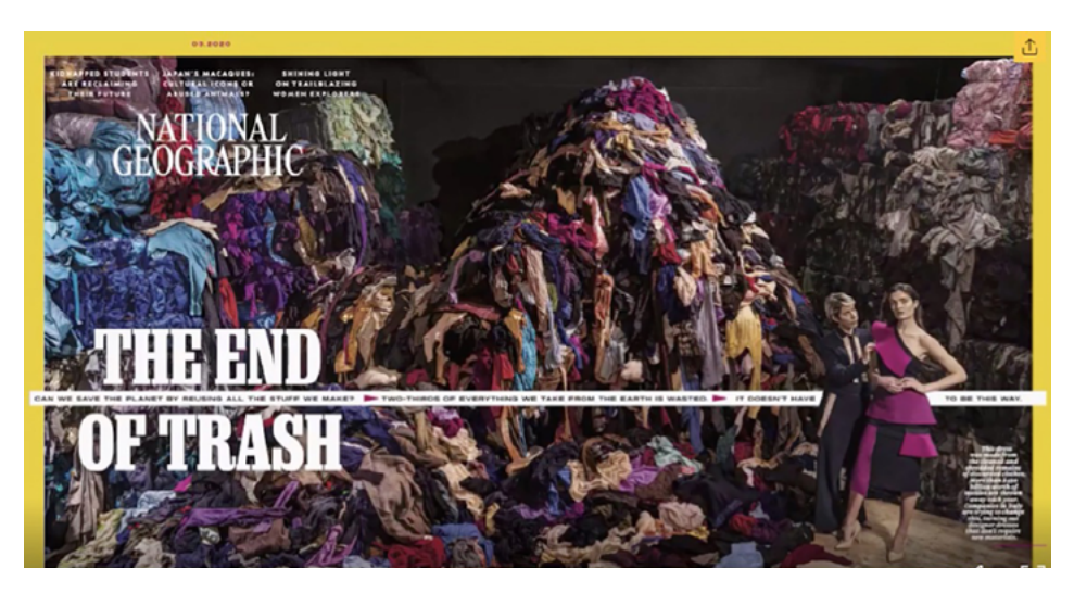
Figure 5. International article about Prato's cloths regeneration (retreived from <a href="https://www.nationalge-ographic.com/magazine/article/editor-can-circular-economy-help-reduce-waste">https://www.nationalge-ographic.com/magazine/article/editor-can-circular-economy-help-reduce-waste</a>).

join the Greenpeace Detox<sup>7</sup> commitments. The common goal is bringing the international Brands to rely on the certainty of eco-friendly products made in Italy (Fig. 5).