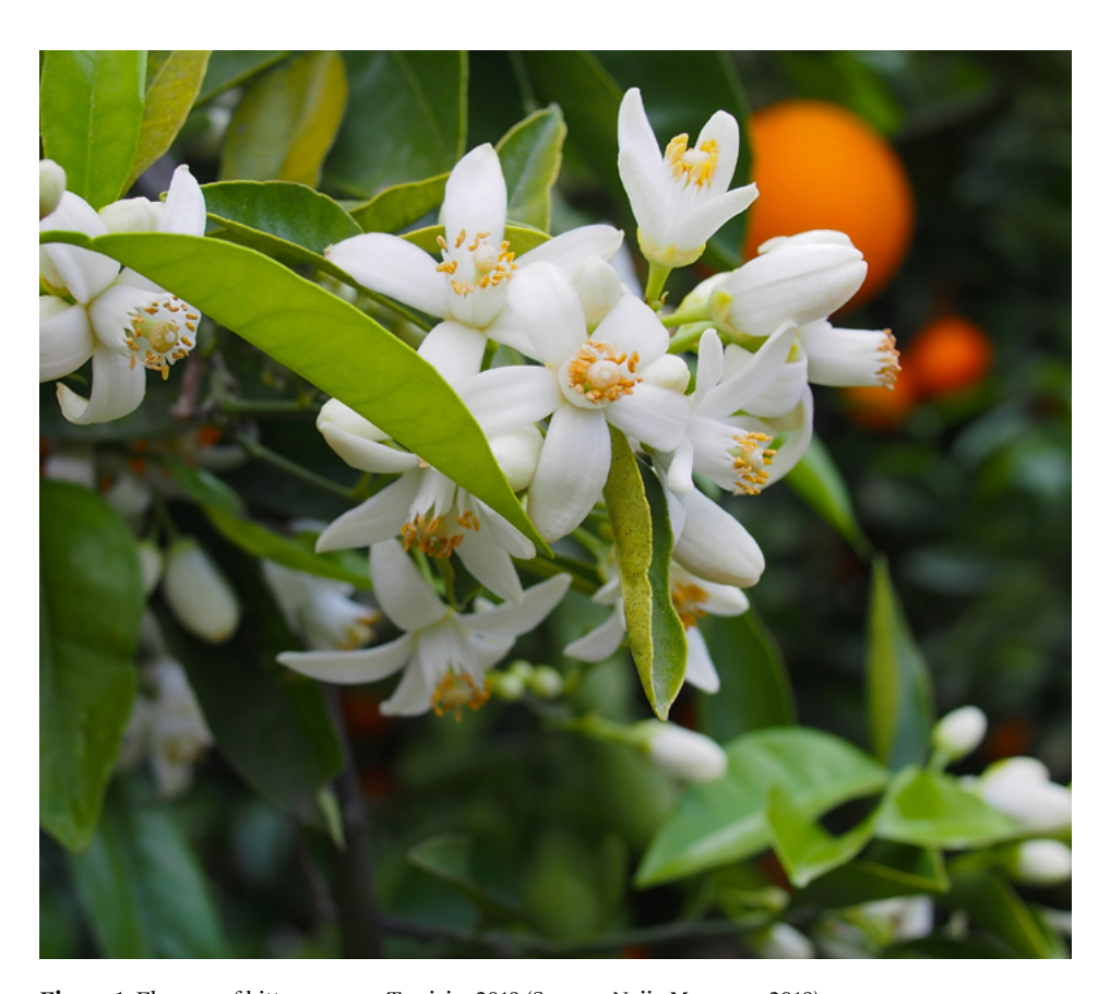
Figure 1. Flowers of bitter orange, Tunisia, 2019.

Craftsmanship culture as a contemporary trend relates to two main contents expressed by Ruskin: "genius", spirit and "aura" of the artefact (Ruskin, 1953).