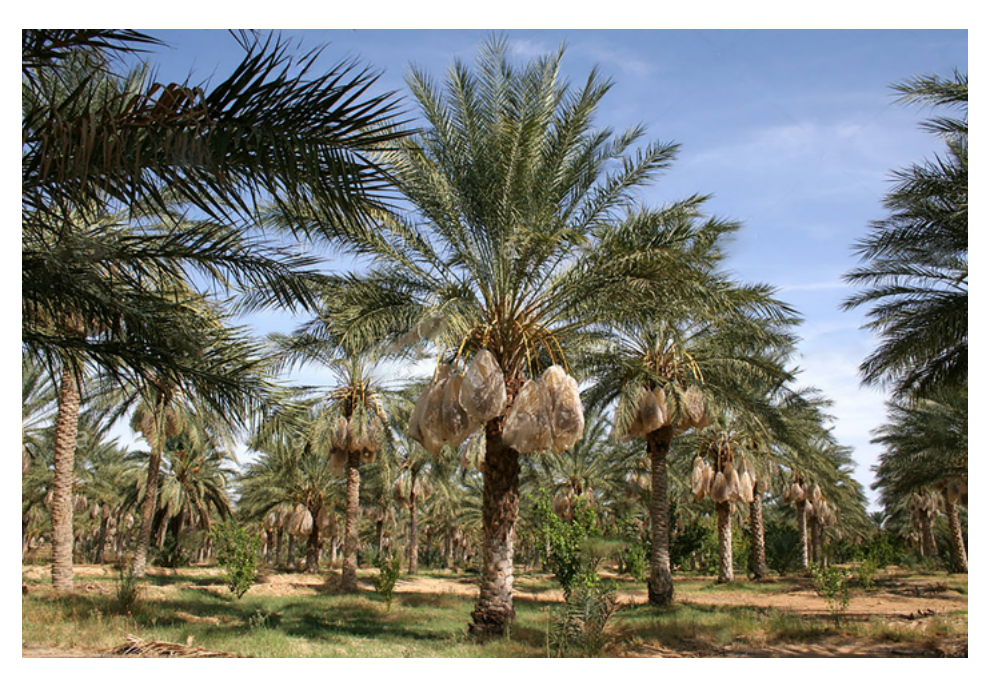
Figure 7. Oasis and Palm trees in El-Jerid region (December 2020).

down through generations practices related to land management, irrigation system, varieties selection and crafted tools adapted to this specific environmental context (Fig. 7).