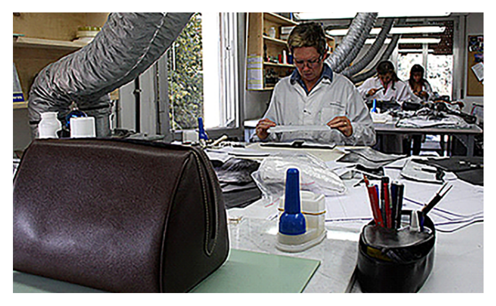
Figure 2. Leather accessory production, Florence (Italy) (Source: Province of Florence, Assessorato Moda, 2007).

Moreover, craft mastery is the result of precious know-how and the passing-on of knowledge and skills through generations which makes craftsmanship highly valued in the whole fashion manufacturing framework (Fig. 2).