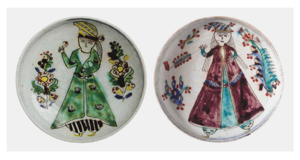
Figure 6. Plates with female figures.

It would be safe to state that within the realm of possibility this figure represents the cosmopolitan order of the Kütahya. Moreover, the reappearance of human figures observed in Turkish arts and crafts objects are assumed to be the work of non-Muslim Armenian craftsmen, recognizably they were used back in the days of Seljuks (S. Çizer, personal communication, April 6, 2021). Another approach suggested by Öney (1976) is that ceramic plates with female figures may be made for the dowry ( çeyiz ) of young women, since the female figures resemble brides with their adorned long hair, ornate shalwars, and high headpieces.