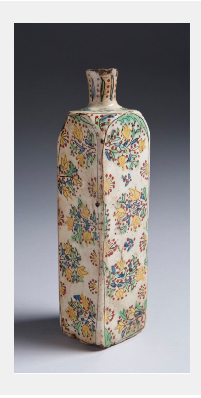
Figure 2. Polychrome bottle.