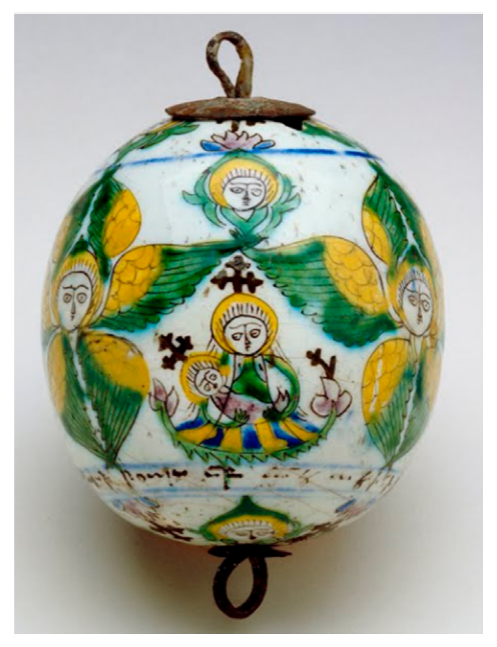
\textbf{Figure 7.} \ Hanging \ or nament \ with \ seraphim. \ Source: \ Alex \ and \ Marie \ Manoogian \ Museum \ Collection, \ Michigan.