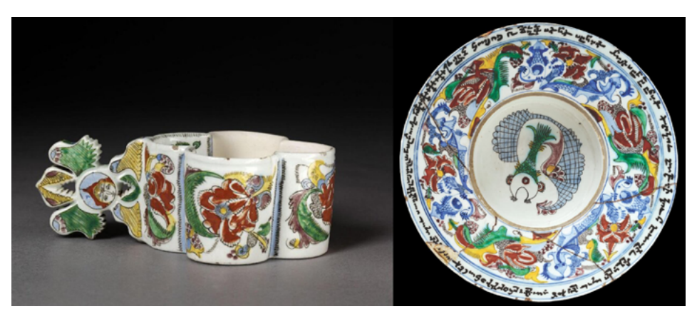
Figure 4. On the left: Incense burner. On the right: Basin.

of this unique variety of patterns seemed to appeal to the Kütahya potters once they realized that new designs could invite a sophisticated category of customers.