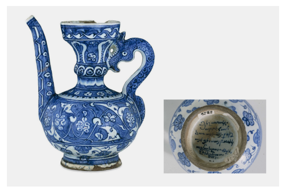
Figure 1. The Abraham of Kütahya Ewer.

Godman Collection in British Museum London (S. Çizer, personal communication, April 6, 2021) (Fig.1). At its base there is an inscription in Armenian that states: "This vessel is in commemoration of Abraham, servant of God, of Kcotcay (Kütahya) in the year 959 (1510 AD) March 11th" (British Museum, n.d.).