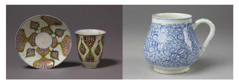
Figure 8. On the left: Coffee cup with saucer. Source: Victoria and Albert Museum, London. On the right: Coffee cup with holder. Source: Victoria and Albert Museum, London.

tastes, and even personalized for use in mobile coffee houses (Gök, 2015; Ögel & Soley, 2014). Although decoration on ceramics depends on the target market, the shapes of the cups were divided into two types: cups having holders and cups having no holders but saucers (Crowe, 2011). It is claimed that the saucers appeared due to European influence on Kütahya ceramics. Apart from these, there are also some cups with envelopes that were designed by Ottomans (Ögel & Soley, 2014). Even though cups in Figure 8 were influenced by blue and white Chinese and Meissen porcelains in terms of patterns, there were also characteristic colors and naive drawings reflecting the Kütahya ceramics.