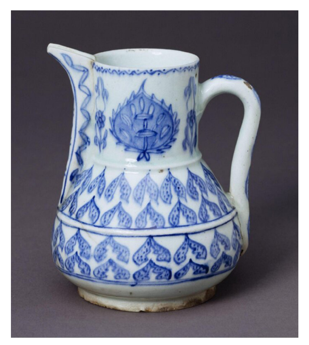
Figure 3. Blue and white jug with cone patterns.

overcome the monotony of the Ottoman ornamental repertoire (Crowe, 2011). If this is the situation, the sudden appearance of new designs like the cone will make logical sense in blue and white Kütahya ceramics.