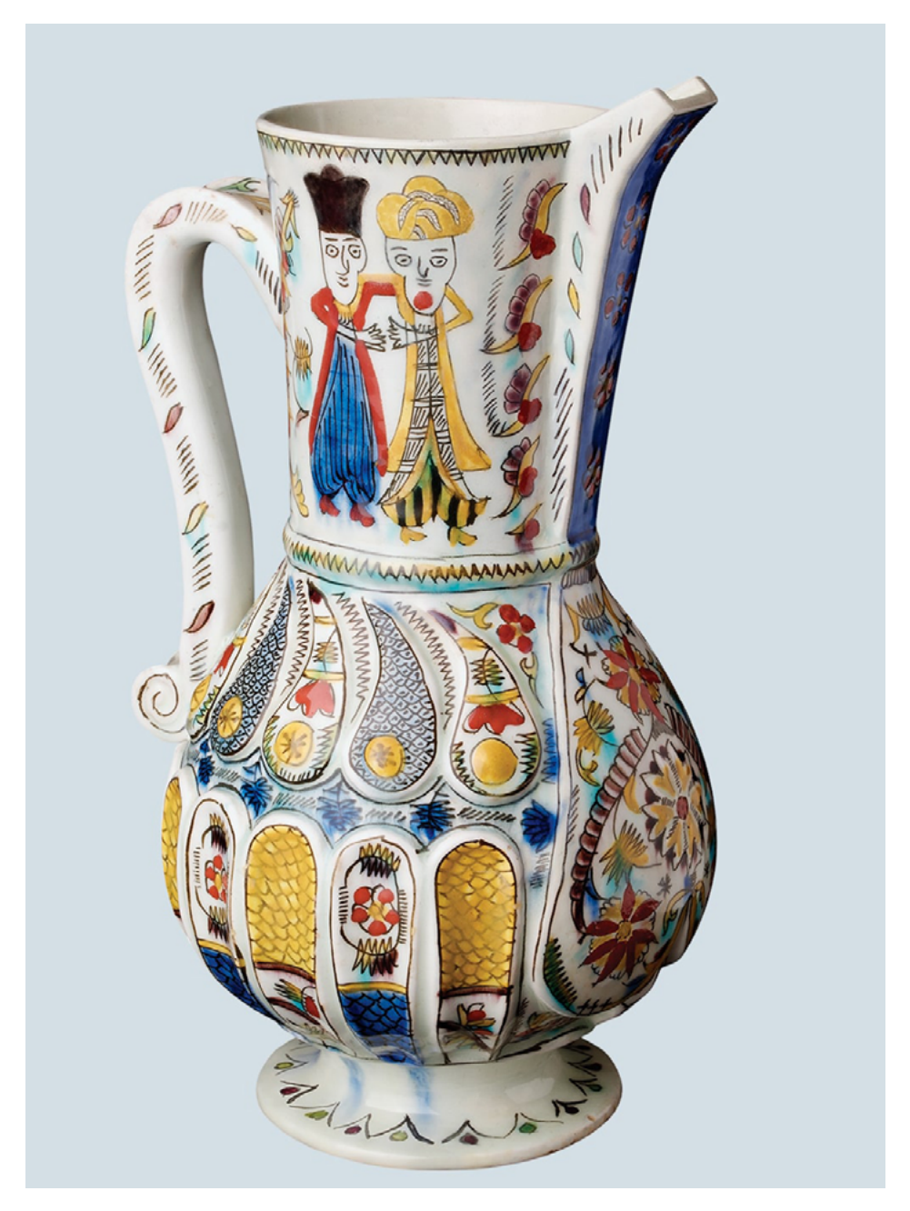
Figure 5. Pitcher with human figures from different religions.