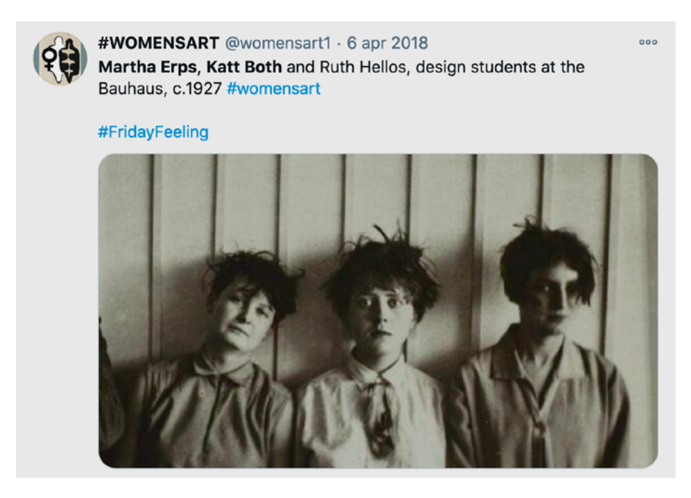
Figure 1. Tweet posted by the Women's Art project curated by PL Henderson, 2020.

Only recently I saw some of the students depicted in one of the icon images of the school properly identified, thanks to the patient research and dissemination work of the Women's Art project <sup>6</sup> curated by PL Henderson and based on the Women's Art: a manifesto written in 1972 by Valie Export.