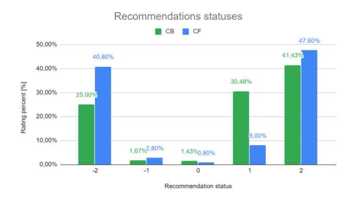
Fig. 4. The percentage distribution of recommendations with different statuses

The percentage distribution of recommendations with different statuses have been also represented in graph which was shown on Figure 4.