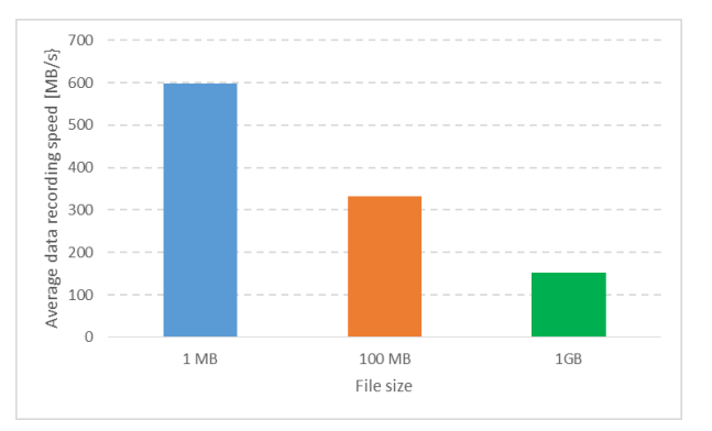
Figure2: Average data recording speed for Oktawave cloud

Technologies such as Bootstrap, PHP Laravel, MySQL were used for its construction. The platform operates in the cloud. The cloud infrastructure used is Oktawave and it provides uniform support for the Quizer platform from various devices, including PCs, notebooks, tablets and smartphones. Its use increases reliability, data security and at the same time reduces the costs of the Quizer platform maintenance. The virtual application server was running on the Linux operating system. Comparison of average data recording speed for three different files is shown in Fig. 2.