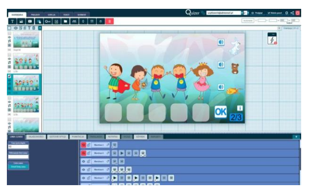
Figure 3: The quiz wizard screen when designing a quiz

The Interactive Quiz Wizard is a tool that allows you to create quizzes. In the Quizer platform two solutions have been used: quizzes can be created in single-player (a single player) and multiplayer (many players) formats. The games may be played against a computer or other users. The quiz wizard screen when designing a quiz is shown in Fig. 3.