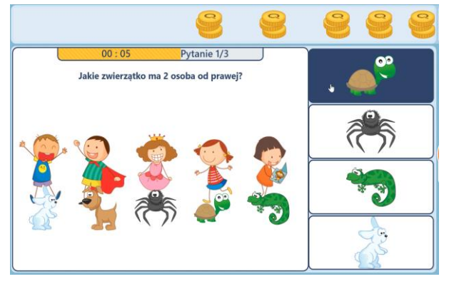
Figure 6: Screen of the game in multiplayer format

An example of a game screen is shown in Fig. 6. The advantage of using games in this age group is the ability to create a situation where teaching is associated with fun. It enables to activate and motivate all students to learn as well as encourages the use of computer technologies to increase their knowledge.