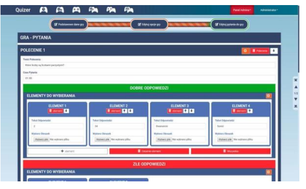
Figure 5: Game edition in the presenter

A presenter is a very important component of the Quizer platform. As in the case of the wizard, one may distinguish a single-player and multiplayer presenter. The game edition in the presenter is shown in Fig. 5.