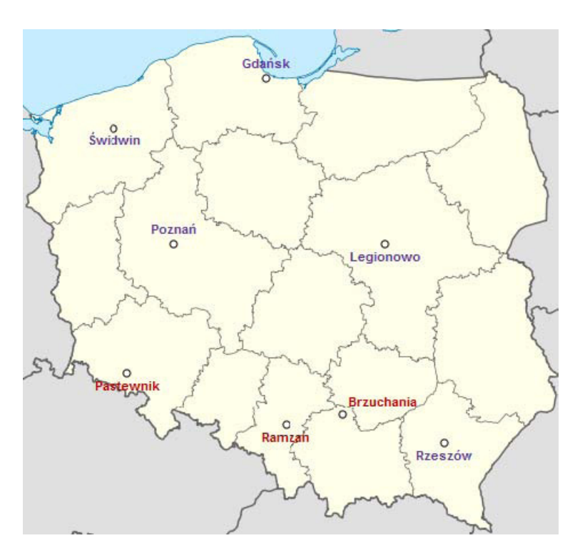
Fig. 3. Arranging radars of the POLRAD system

and the migration of meteorological objects in the troposphere within range. These measurements constitute an important source of the input for numerical meteorological and hydrological models. The POLRAD network consists of eight radars (fig. 3) of German production (Gematronik)<sup>8</sup>.