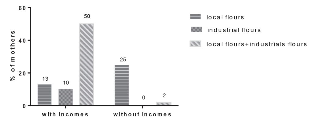
Figure 1: Relation between frequency of use of local flours and mothers economic conditions.

analysis of the results of the biochemical parameters was carried out using the STATISTICA 7.1 software (Statsoft Inc., Tulsa-USA Headquarters). Averages were compared using the Duncan test at the 5% threshold.